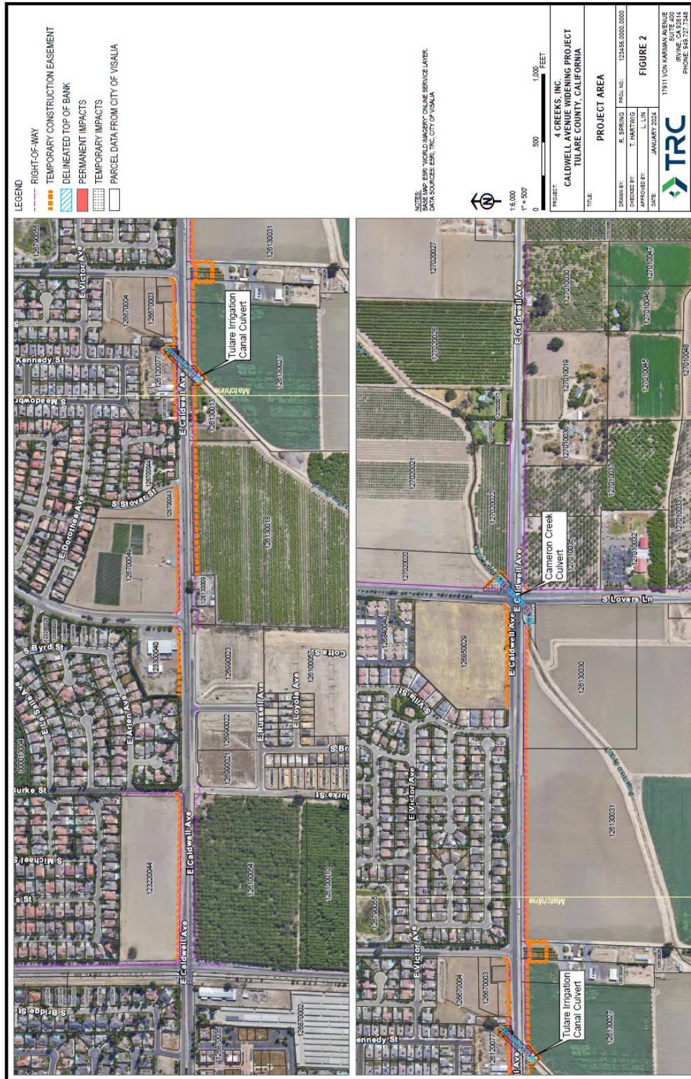
Figure 1: Vicinity Map of Project Locations