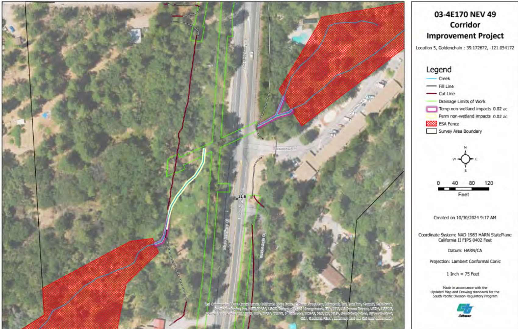
Figure 5: Location 5, Goldenchain Impact Map