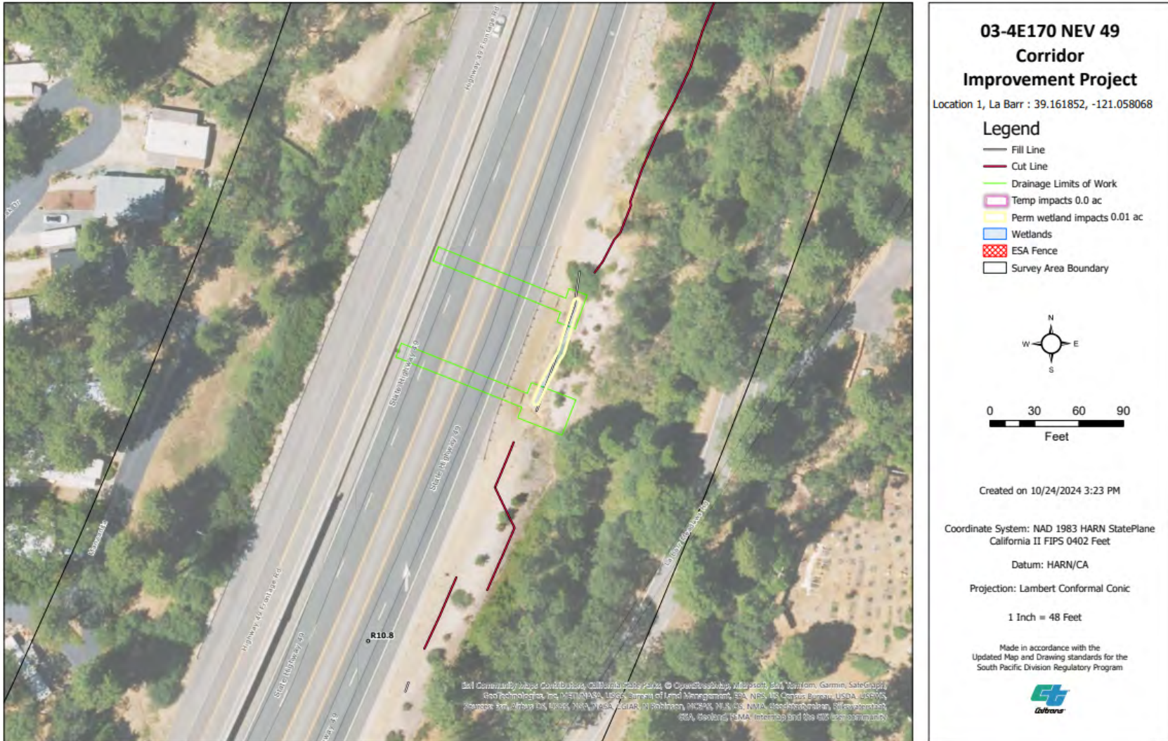
Figure 1: Location 1, La Barr Impact Map