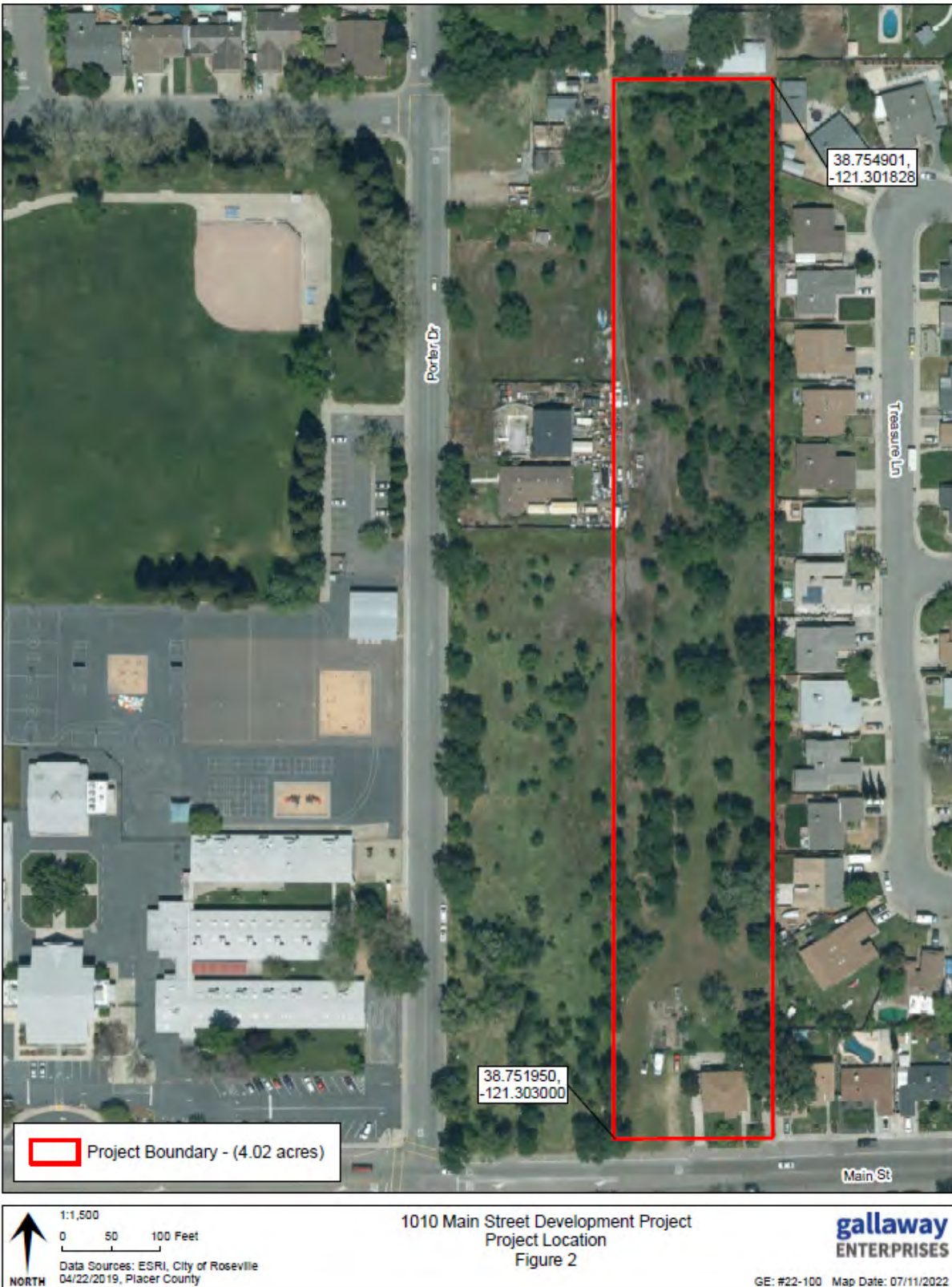
Figure 2: Project Location