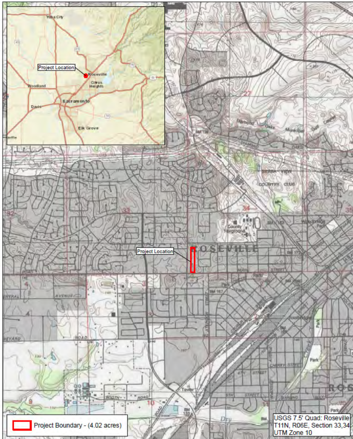
Figure 1: Regional Location

1:24,000 0 0.25 0.5 Miles NORTH Data Sources: ESRI, USGS, Placer County