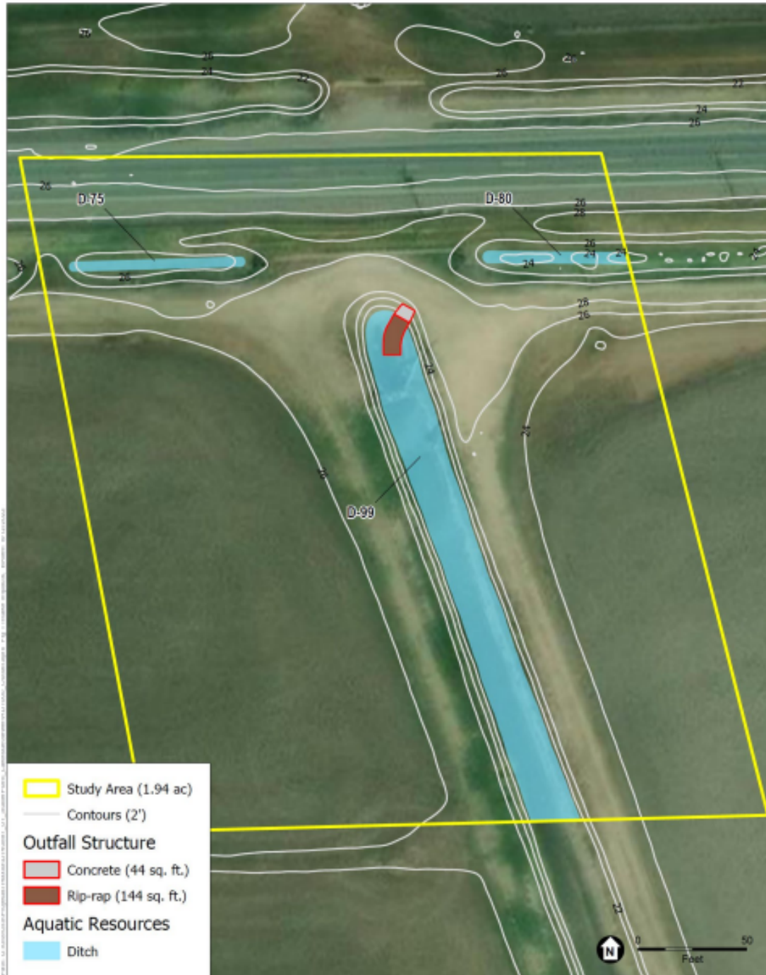
Figure 2: Impacts Map