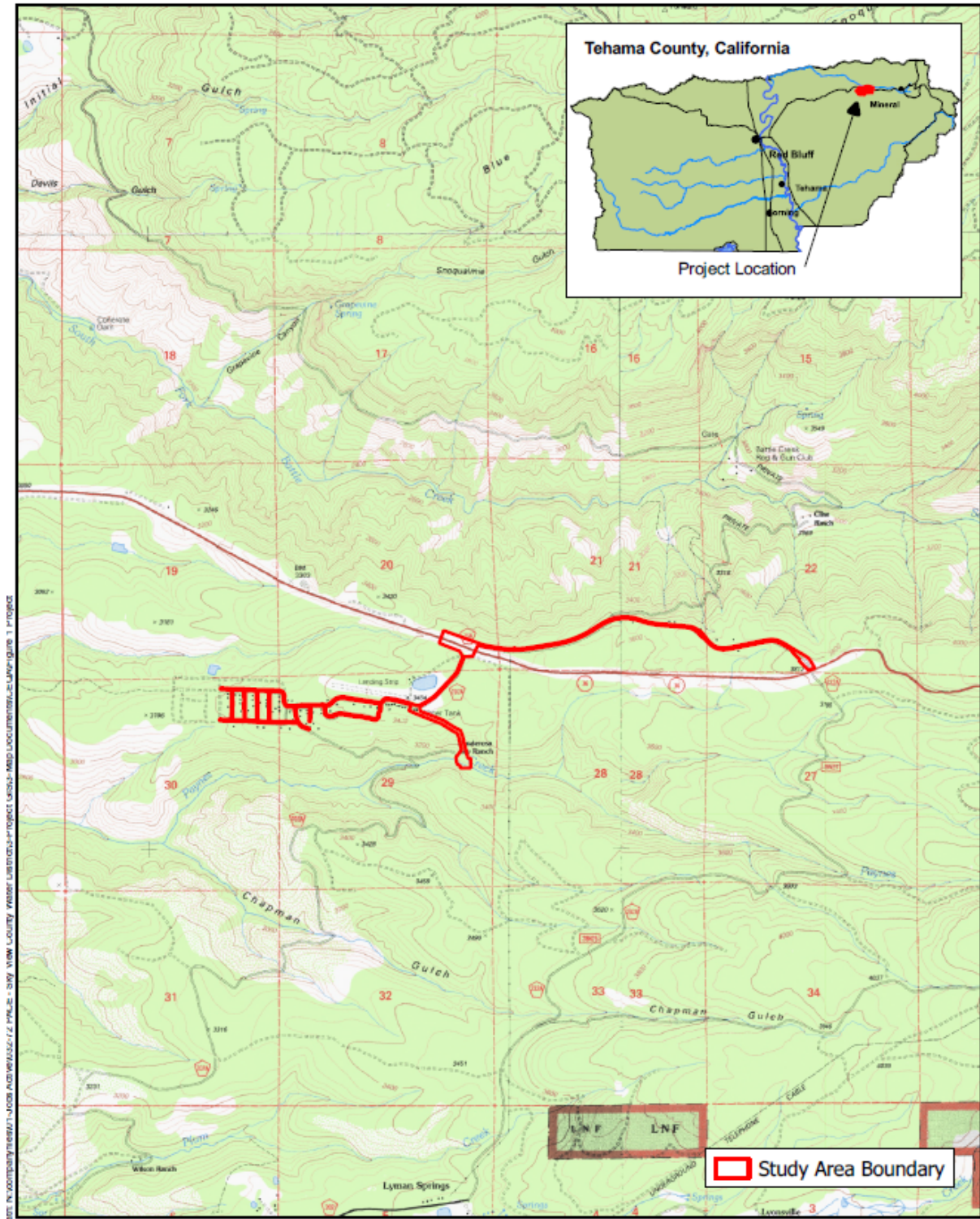
Figure 1 Project Location and Vicinity