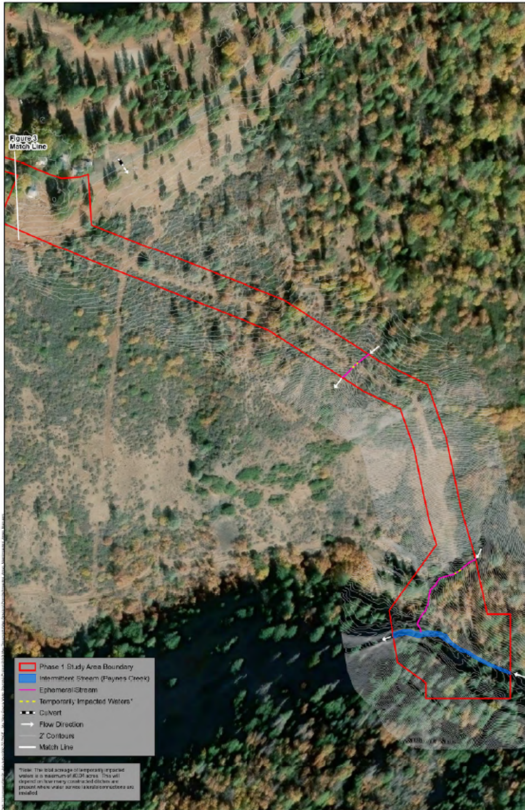
Figure 4 Impacted Waters