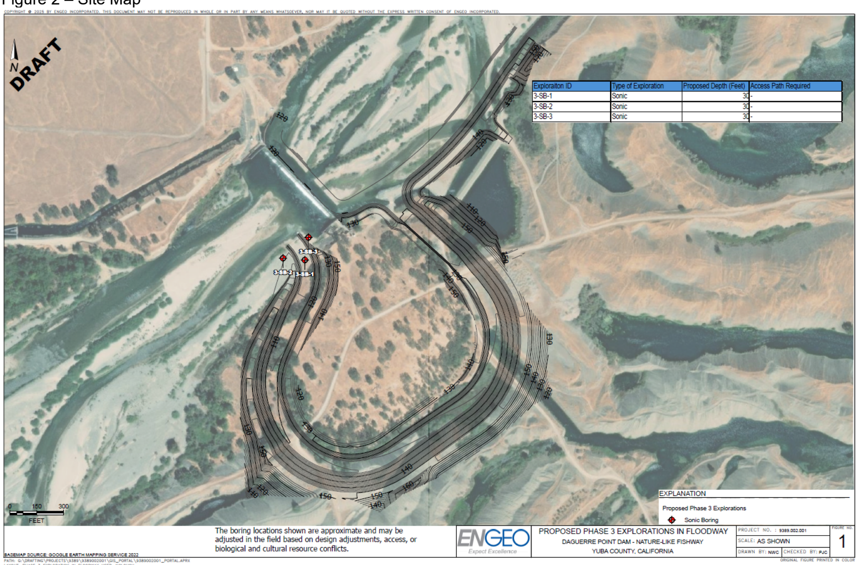
Figure 2 – Site Map