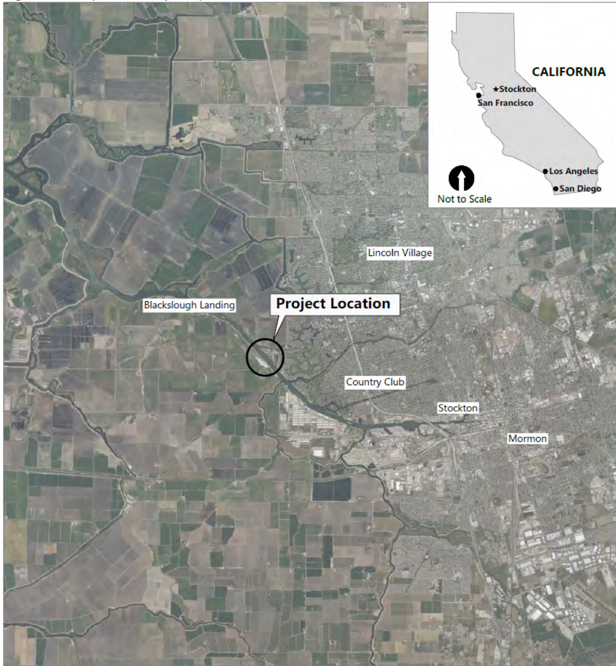
Figure 1: Project Vicinity Map