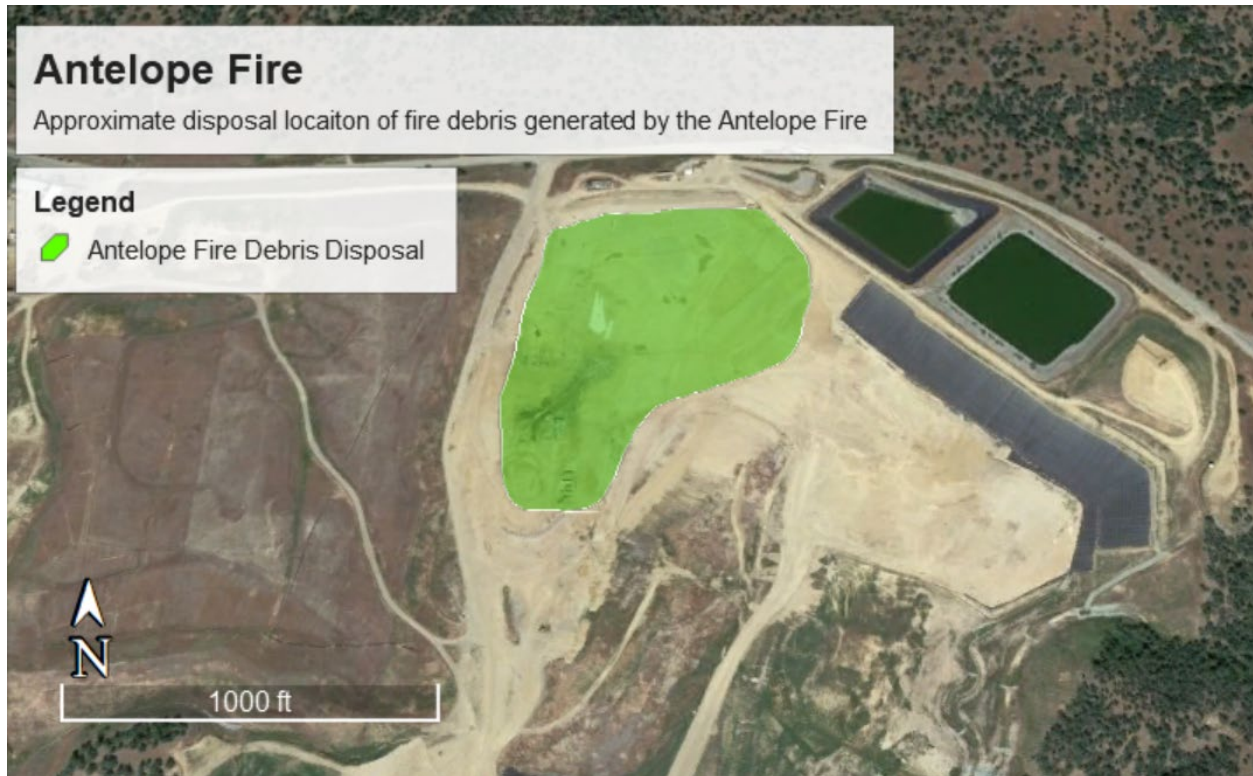
Figure 1 Approximate limits of fire debris accepted in the cleanup of the Antelope Fire. Types of materials accepted: debris and ash from a structure burned in a wildfire area. Fire debris may contain metal, concrete, building materials, and contaminated soil