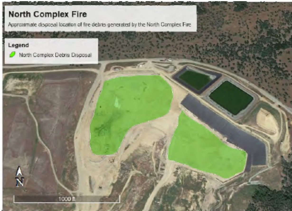
Approximate limits of fire debris accepted in the cleanup of the North Complex Fire. Types of materials accepted: debris and ash from a structure burned in a wildfire area. Fire debris may contain metal, concrete, building materials, and contaminated soils.