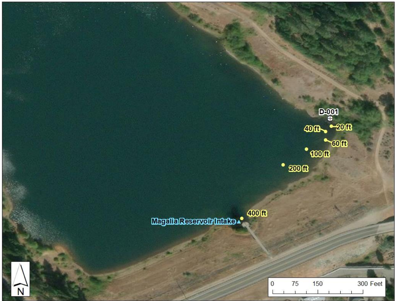
Figure F-1. Confirmation Sampling Locations in Magalia Reservoir

iv. Evaluation of Available Dilution for Human Health Criteria. The SIP requires a mixing zone must be as small as practicable and comply with eleven (11) mixing zone prohibitions under section 1.4.2.2.A. Based on Central Valley Water Board staff evaluation, the mixing zone extends up to 60 feet downstream of the Facility’s outfall and a maximum available dilution credit of 58 meets the eleven prohibitions of the SIP as follows: