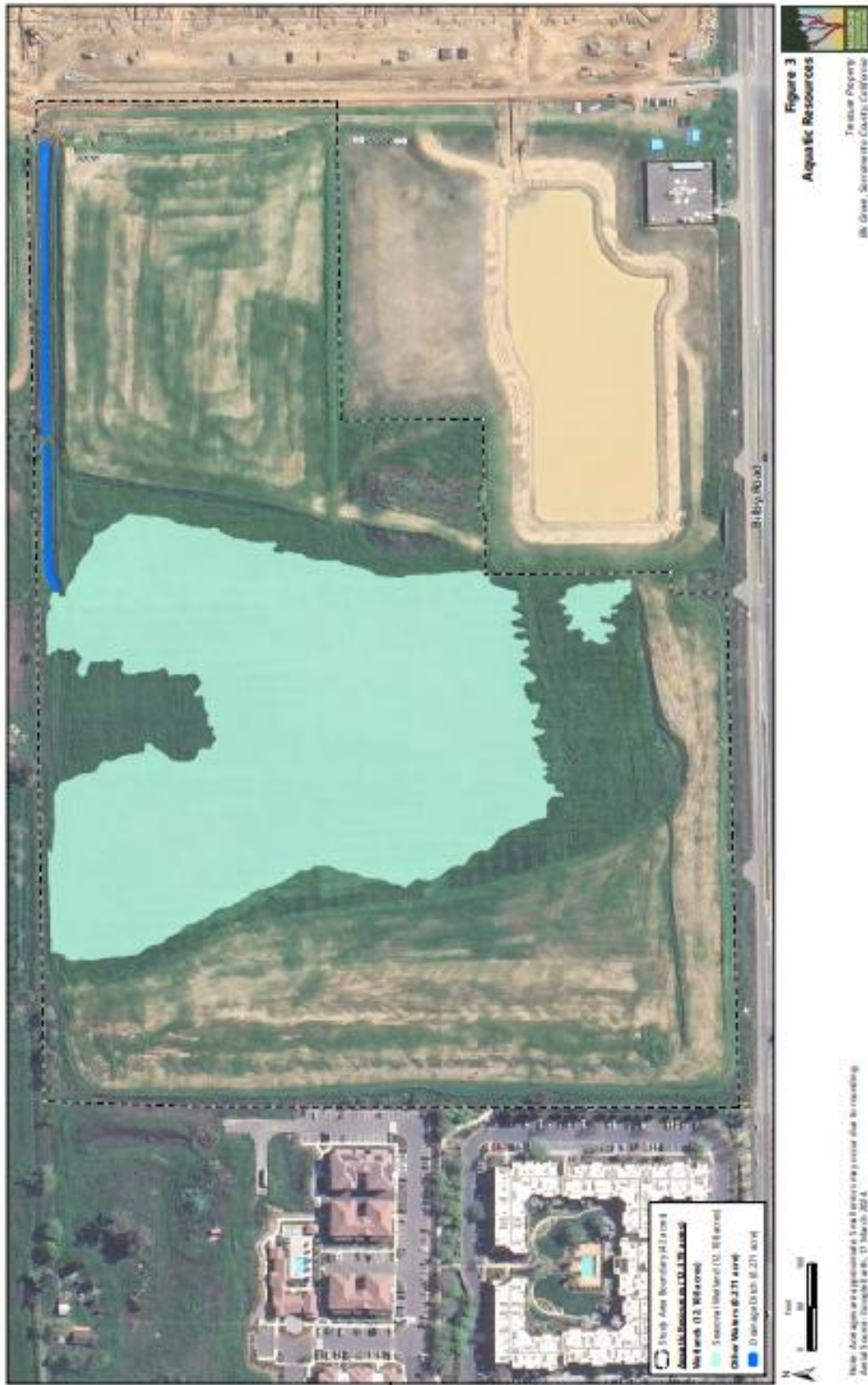
Figure 2 Site Map