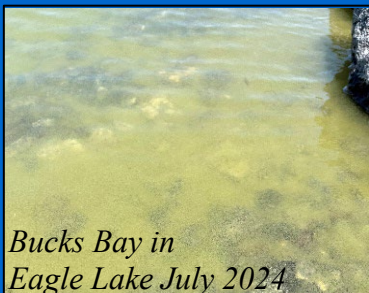
Bucks Bay in Eagle Lake July 2024

These isolated monitoring efforts highlight the importance of regular sampling and collaboration to protect Eagle Lake's ecological and recreational health. Visually, cyanobacteria were present at all sampled locations, including the North Basin, prompting caution advisories due to the potential for rapid changes in toxin levels.