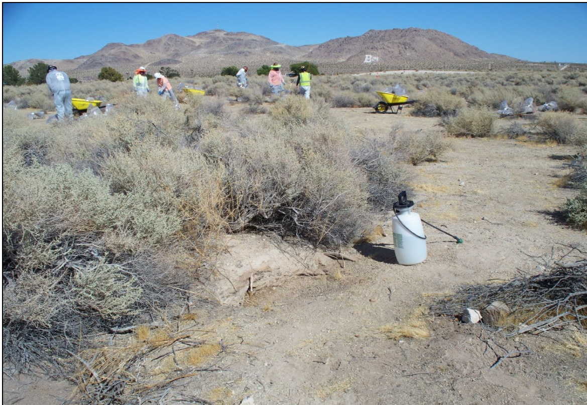
Photo 2.1: Photo showing a Navy consultant field crew collecting asbestos-containing material and lead-containing paint during the time-critical removal action at Site 87-B.

Installation Restoration Program (IRP) Site 87-B Time-Critical Removal Action - IRP Site 87-B is a former Navy residential housing area that was demolished in the late 1990s and early 2000s. Building demolition debris remained at the site including asbestos-containing material and lead-containing paint. The Navy initiated a time-critical removal action (TCRA) at the site to remove the asbestos containing material and lead paint materials. The Navy consultant provided a summary of this time-critical removal action. The TCRA involved setting up grids across the site and systematically inspecting those grids. While crews walked/inspected the grids across the site they manually removed surface debris across approximately 53 acres. In total, 22,000 pounds of asbestos and 250 pounds of lead containing materials were picked up off the ground surface and transported offsite for proper disposal (Photo 2.1).