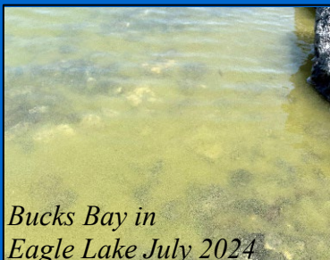
Bucks Bay in Eagle Lake July 2024

These isolated monitoring efforts highlight the importance of regular sampling and collaboration to protect Eagle Lake's ecological and recreational health. Visually, cyanobacteria were present at all sampled locations, including the North Basin, prompting caution advisories due to the potential for rapid changes in toxin levels.