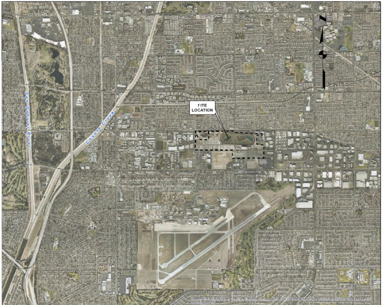
Figure 1: Site Location of the Los Alamitos Race Course