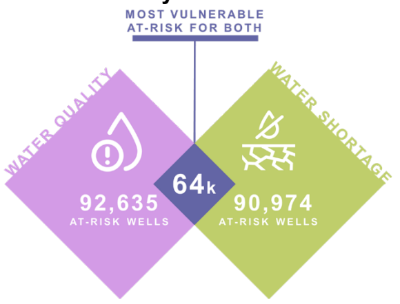
Figure 2: At-Risk State Small Water Systems

Table 3 shows the approximate counts of At-Risk domestic wells<sup>13</sup> statewide located in different risk areas based on data from the 2022 Needs Assessment. Based on the 2022 analysis there are approximately 92,635 domestic wells At-Risk for water quality and 90,974 At-Risk for drought respectively. When analyzed, using the Combined Risk Assessment method, there approximately 64,176 domestic wells that are At-Risk for both water quality and drought risk. These domestic wells can be viewed as the most vulnerable of the At-Risk wells identified.