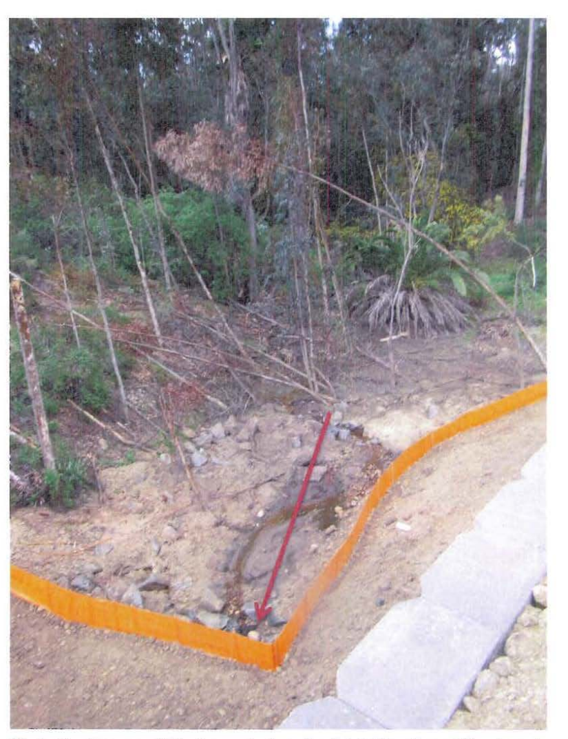
Photo 3 - Unnamed tributary entering pipe inlet. Direction of flow in red.