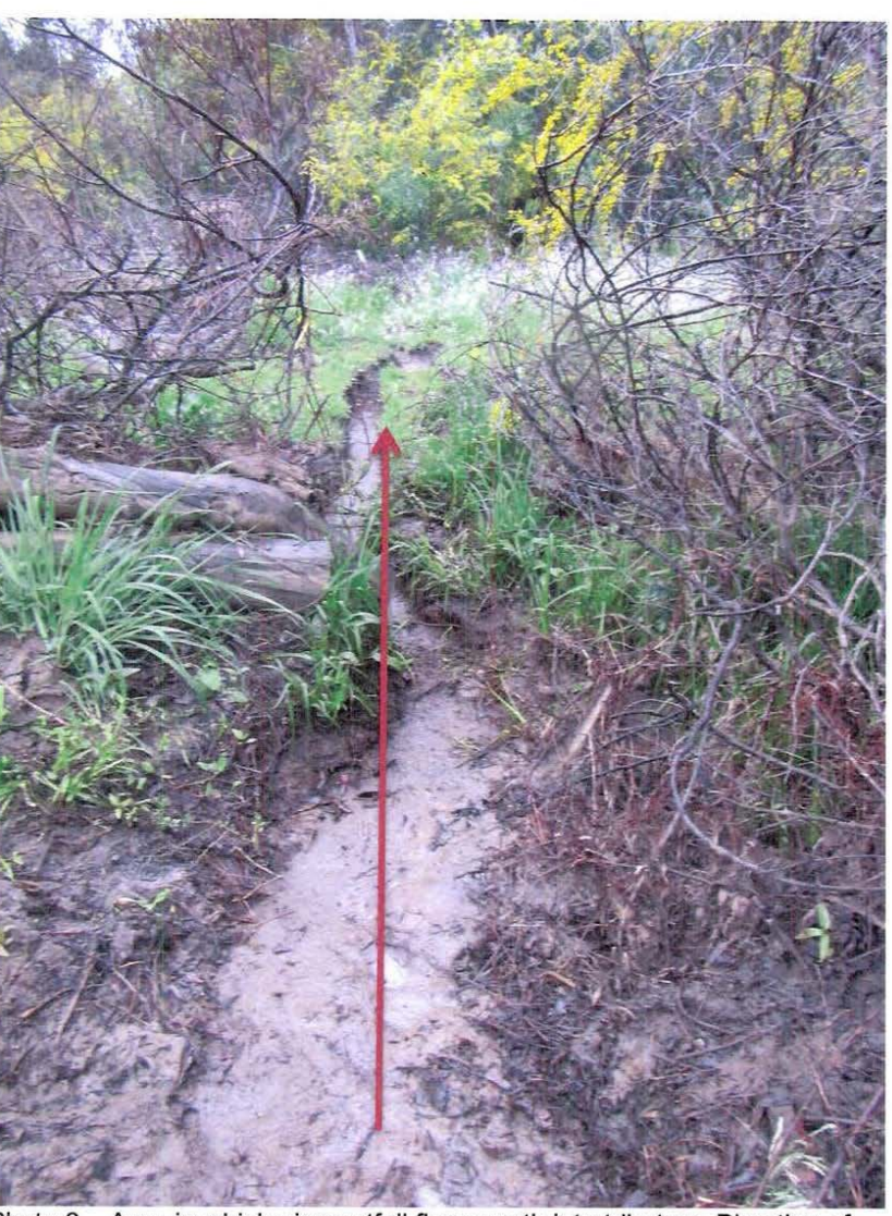
Photo 6 – Area in which pipe outfall flows north into tributary. Direction of flow in red.