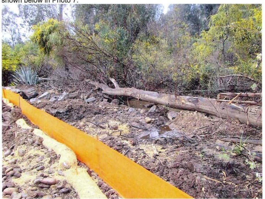
Photo 7 –Construction activities and debris have entered entering waters of the United States and/or State.