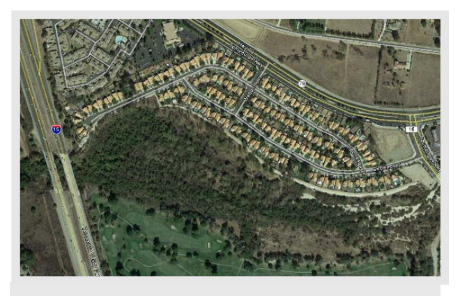
Temecula Creek Conservation Easement