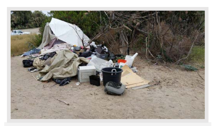
Murrieta Creek Encampment