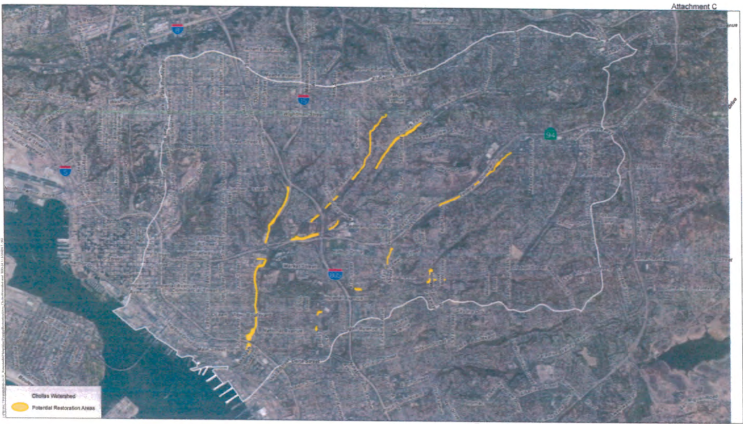
Potential Creek Restoration Areas - Chollas Watershed CHOLLAS WATERSHED MASTER PLAN