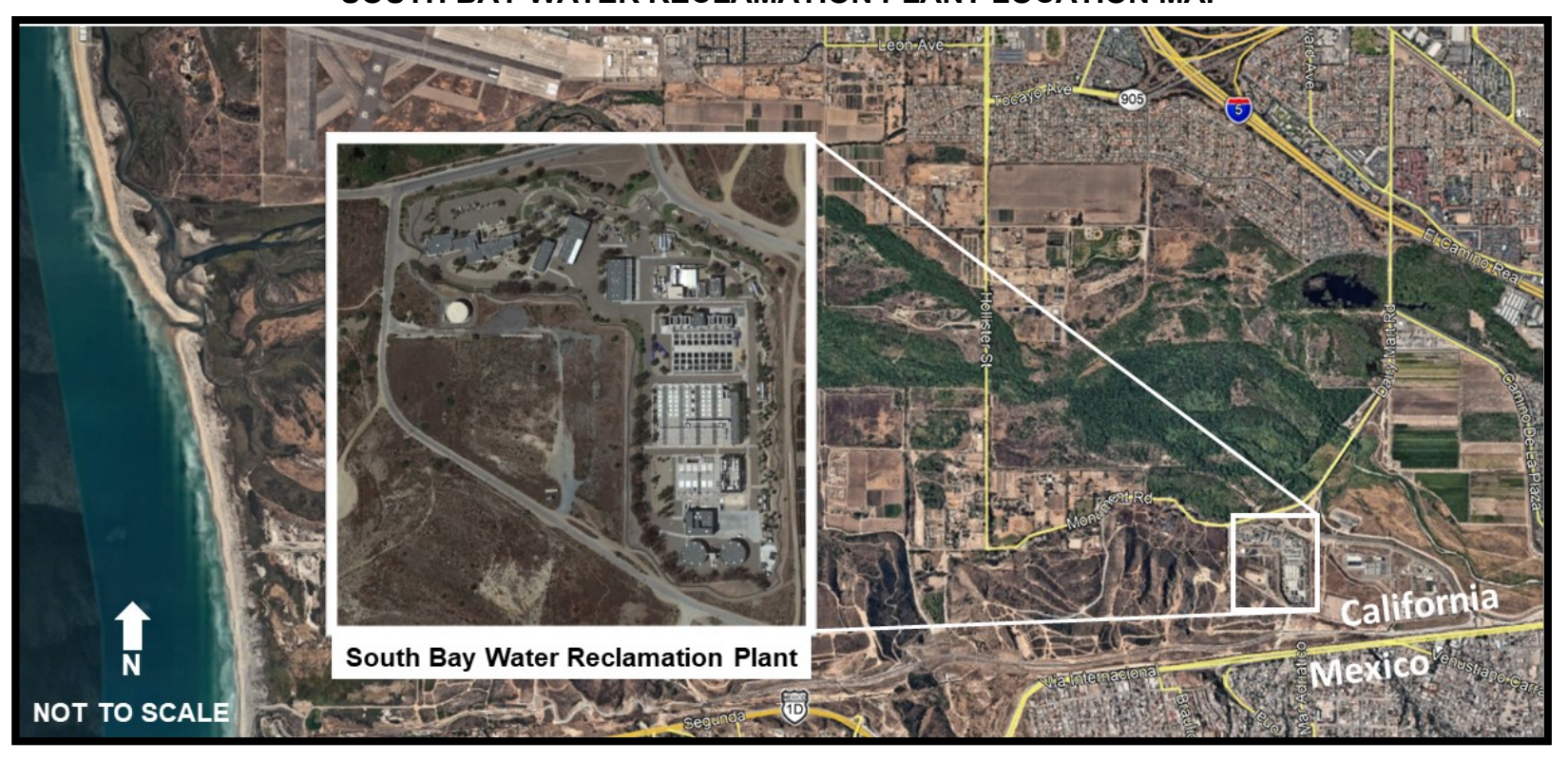
FIGURE 1 SOUTH BAY WATER RECLAMATION PLANT LOCATION MAP