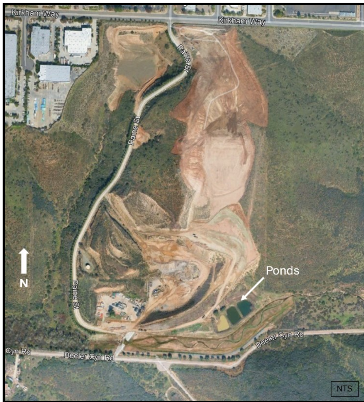
Figure 2. Aerial photo showing a detailed view of the Facility.