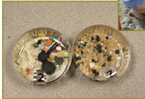
SCCWRP researchers sift beach sand (top) to sample debris smaller than 5 mm (left).