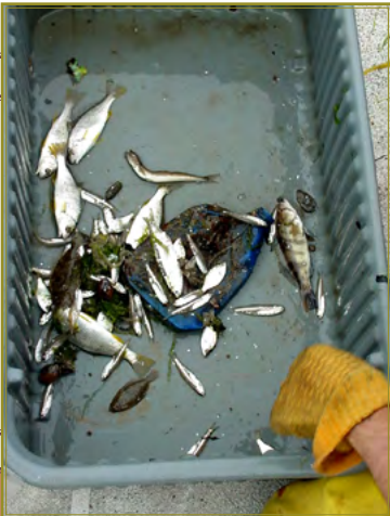
Regional studies monitor both organisms and debris in trawl samples from the ocean floor.