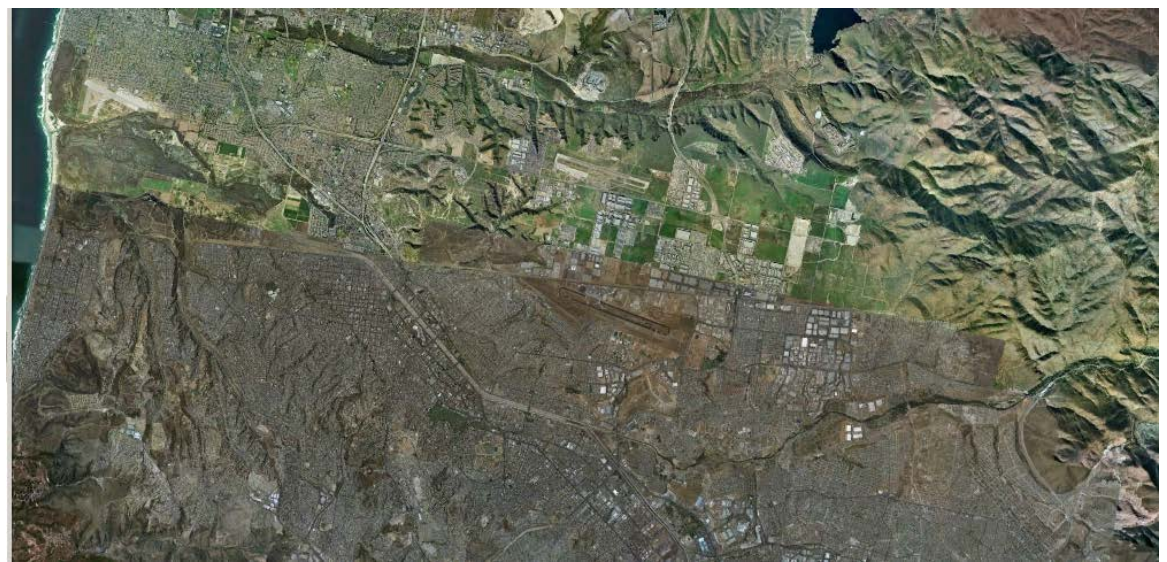
Figure 1 Rio Alomar is at the lower right corner; Tijuana River Valley is at the upper left corner (from Google map).