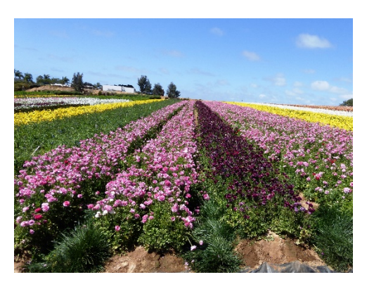
Commercial Growers Must Seek Regulatory Coverage or Risk $1,000 (Maximum) Fine Per Day