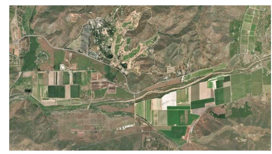
San Pasqual Valley