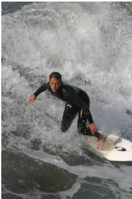
Surfer at Ocean-Beach, San-Diego-County

In addition, the fecal coliform concentration shall not exceed 400 organisms per 100 ml for more than 10 percent of the total samples during any 30-day period.