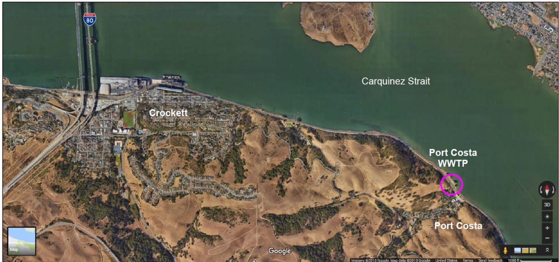
Figure B-1. Facility Location