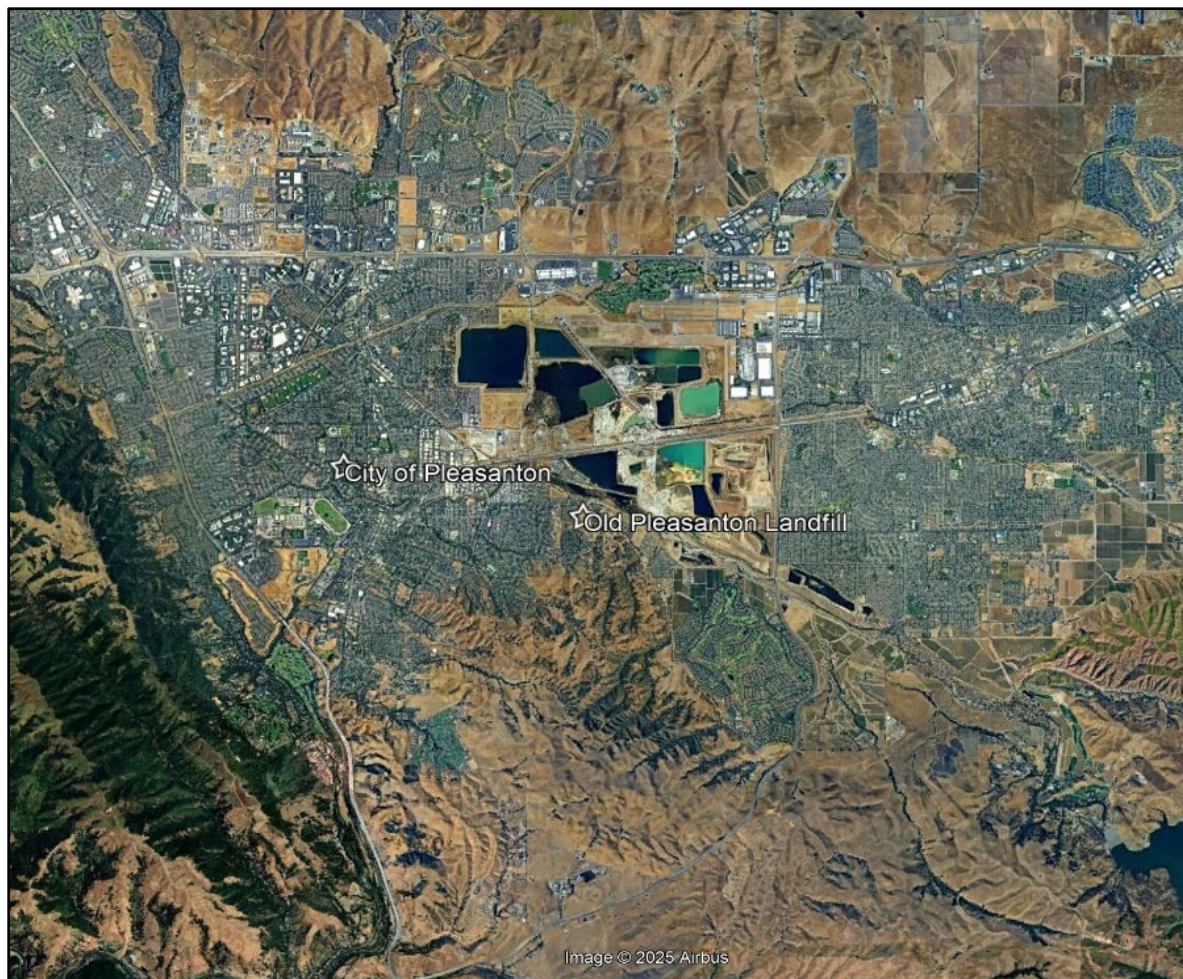
Figure 1. Old Pleasanton Landfill Site Location Map.