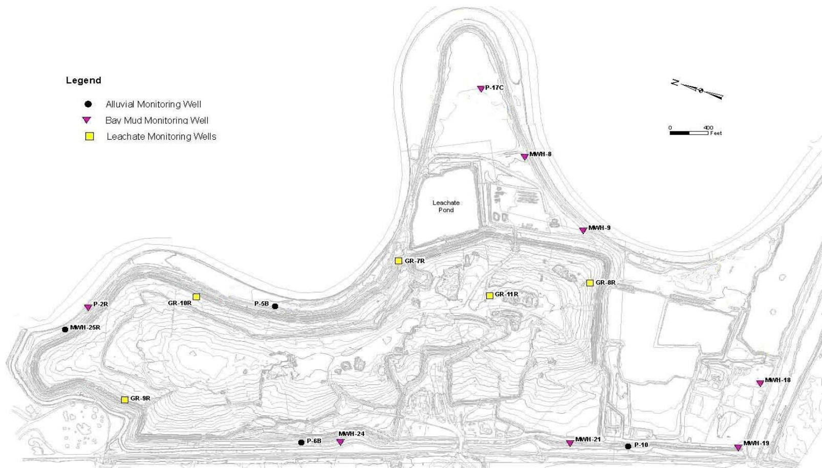
FIGURE 3. GROUNDWATER AND LEACHATE MONITORING LOCATIONS