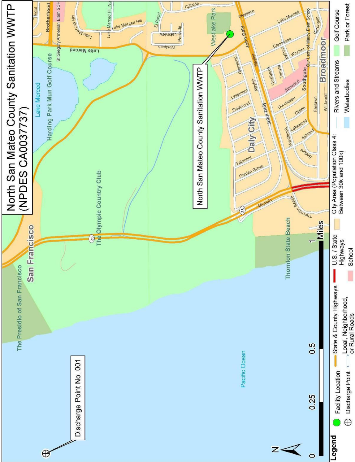
Figure B-1. Facility Location