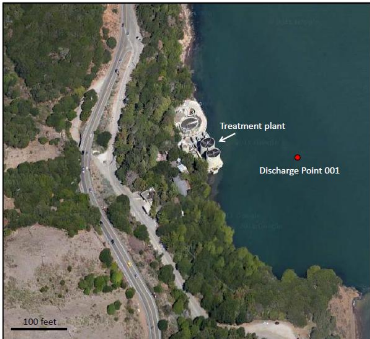
Sausalito-Marín City Sanitary District