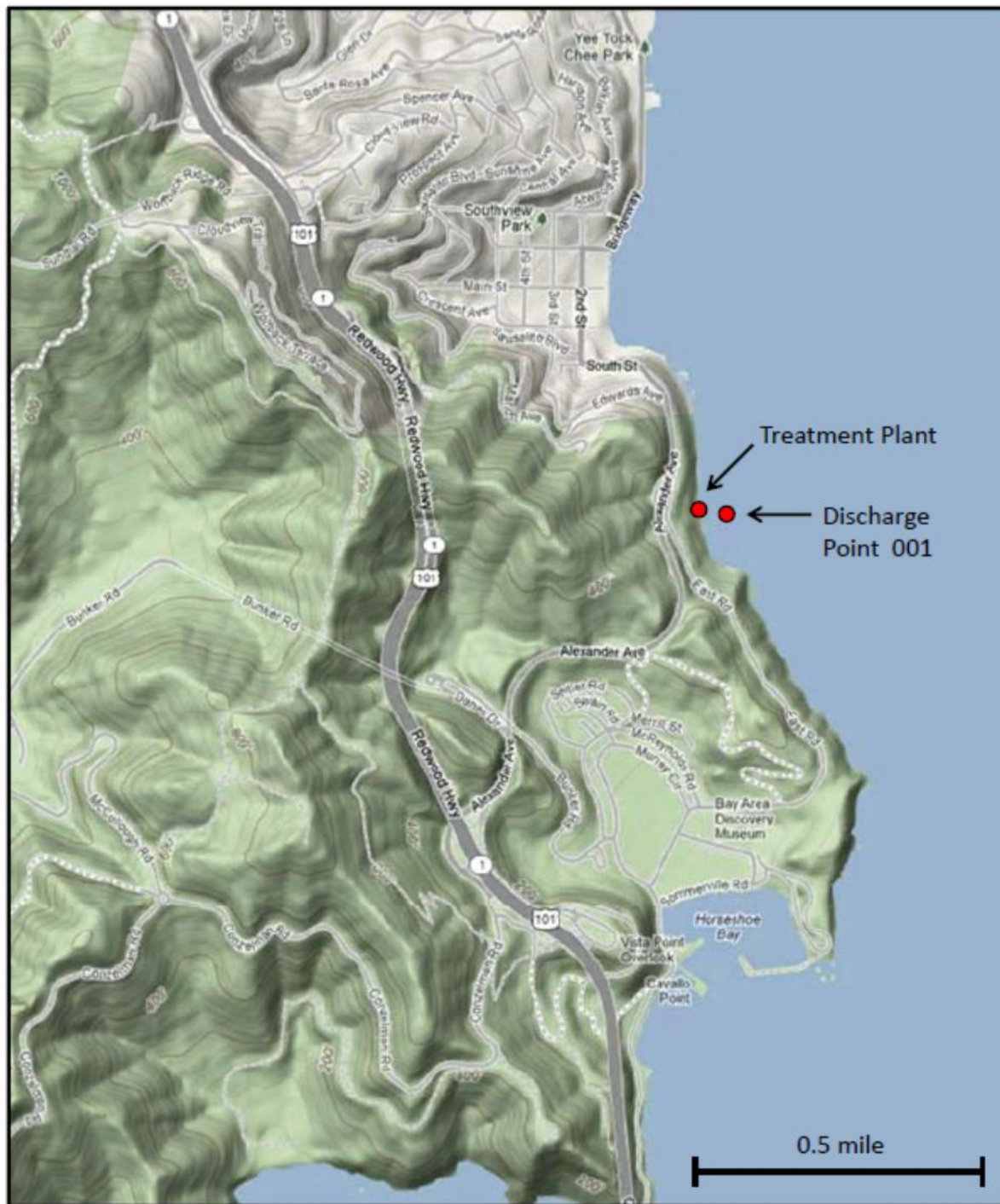
Figure B-1. Facility Location Topographic Map