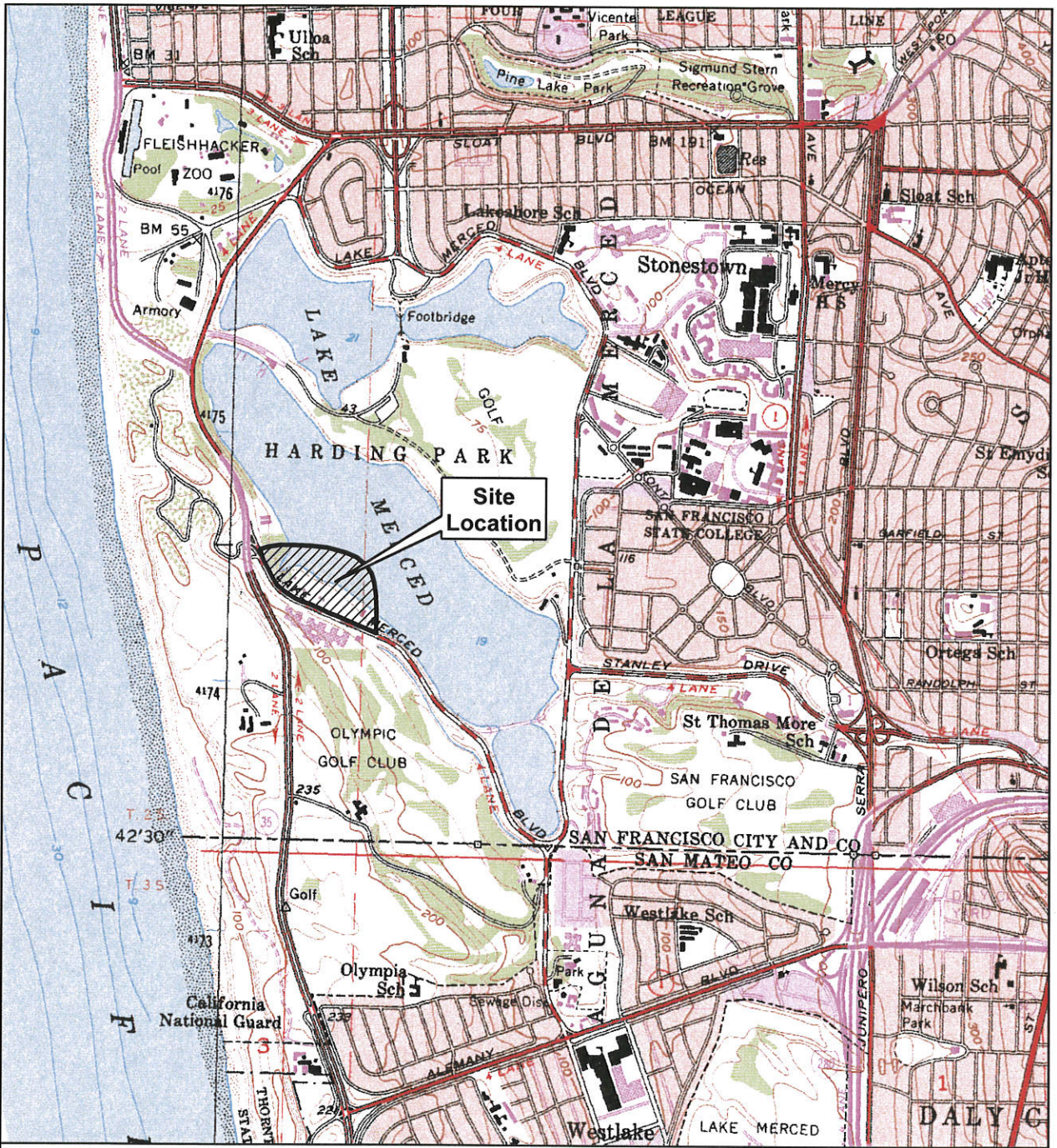
Base map from USGS 7.5' San Francisco South, California topographic quadrangle.

File path: S:\15200\15280\15280.000\task_08\11_0131_prgc_fig_01\sm.mxd; Date: 04/19/2011; By: kristin.uber