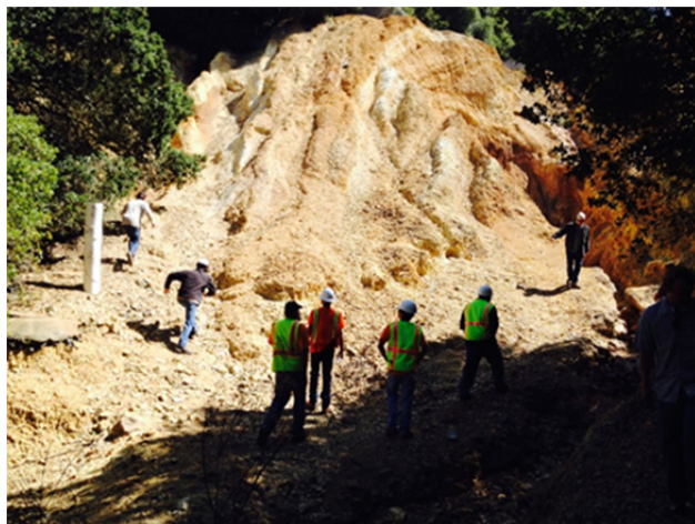
Photo 1a. Site workers inspect upper mining waste pile.