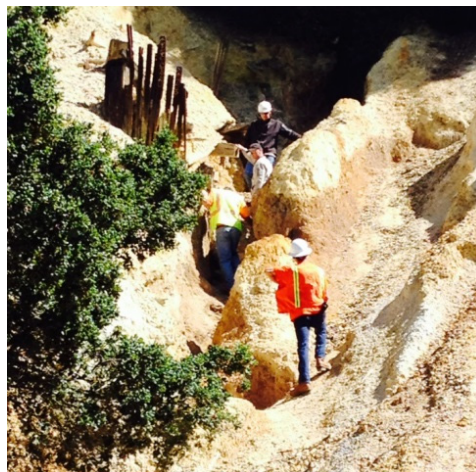
Photo 1b. Site workers inspect adit.