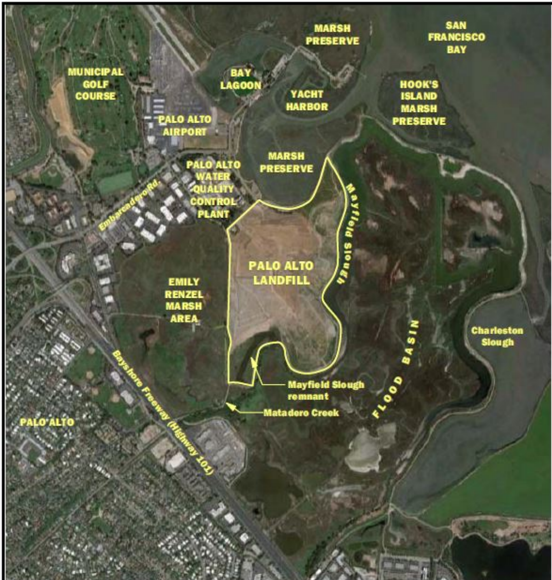
Figure 1. Palo Alto Landfill Project Site Location.

Dated March 28, 2015.