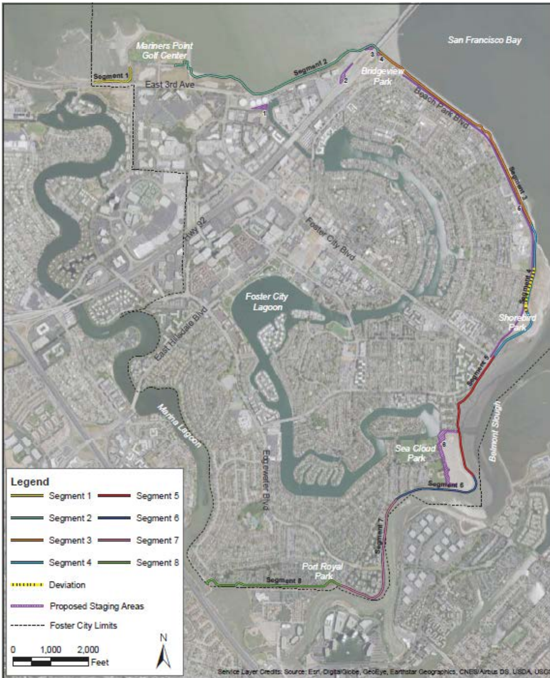
Figure 6. Map of Levee Segments

Outcome of September 2017 City Council Special Meeting: During the September City Council Special Meeting there was a presentation by Foster City's consultant regarding the feasibility of building to the 2050 or 2100 SLR scenarios. Although the Proposed Project is being planned to address 2050 SLR elevations, Foster City conducted additional geotechnical analysis to evaluate the use of sheet pile floodwalls to achieve 2100 SLR design elevations. The additional analysis showed that this wouldn't be feasible; the depth to which they would have to be constructed in Bay Mud would result in