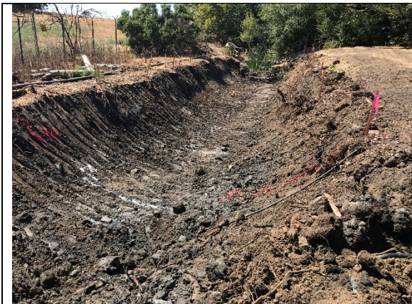
Figure 3. Excavation of IR-8 Drainage Channel

The 3.91-acre project site (shown in Figure 2) includes two channels (IR-8 and IR-6) that convey stormwater and sediment runoff from the SLAC campus to San Francisquito Creek via two culverts. IR-8 is perennially fed by groundwater from the underdrain system beneath the linear particle accelerator tunnel. IR-6 is intermittent and consists of two channels (IR-6 primary and IR-6 secondary) separated by an earthen berm vegetated with grasses, plants, and trees. Riparian woodlands occur on both sides of IR-8 and a perennial freshwater marsh occurs near the IR-6/8 confluence.