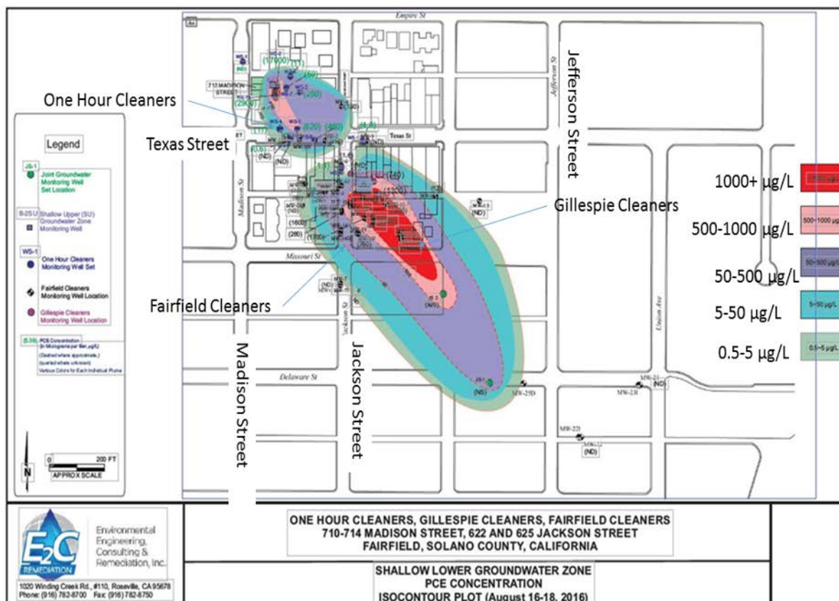
Figure 1. Map of solvent plume in groundwater and locations of overlying drycleaner sites

For several years, dischargers at the three sites disagreed about their relative contributions to the commingled groundwater plume and an appropriate cleanup strategy. Several of the dischargers had old insurance policies that potentially covered the releases, and discussions with the insurers complicated matters. Water Board staff encouraged a collaborative approach but without initial success.