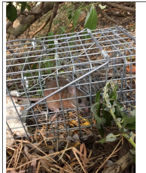
Figure 5. Dusky-footed Wood Rat trapped for relocation prior to excavation

In accordance with the plan, excavation, backfilling, and initial restoration with grass seed and erosion control was completed in August and September (see Figures 3 and 4). Best Management Practices (BMPs) were used to minimize contaminated sediment conveyance to, and deposition in, the channels. Avoidance and other measures were followed to minimize potential effects to the San Francisco Dusky-footed woodrat and California red-legged frog, (as shown in Figure 5). Final restoration includes planting cattails and willows in wetland and riparian areas during the winter season and is scheduled for January or February 2018.