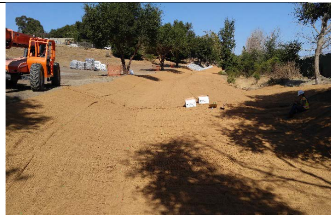
Figure 4. Completed Drainage Channel with erosion control matting