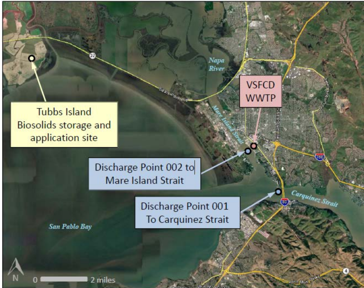
Figure 1. Vicinity Map