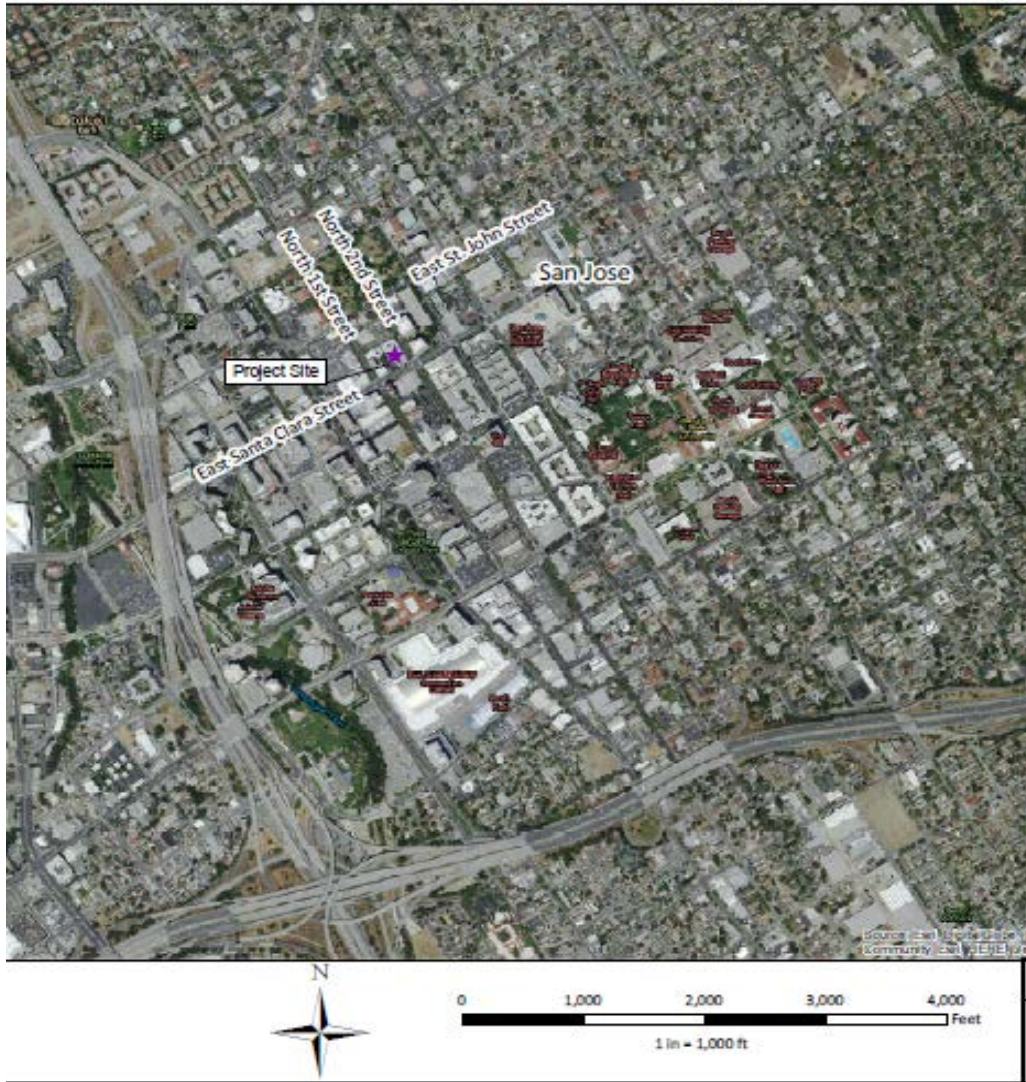
Figure 1. Site Map – Downtown San Jose