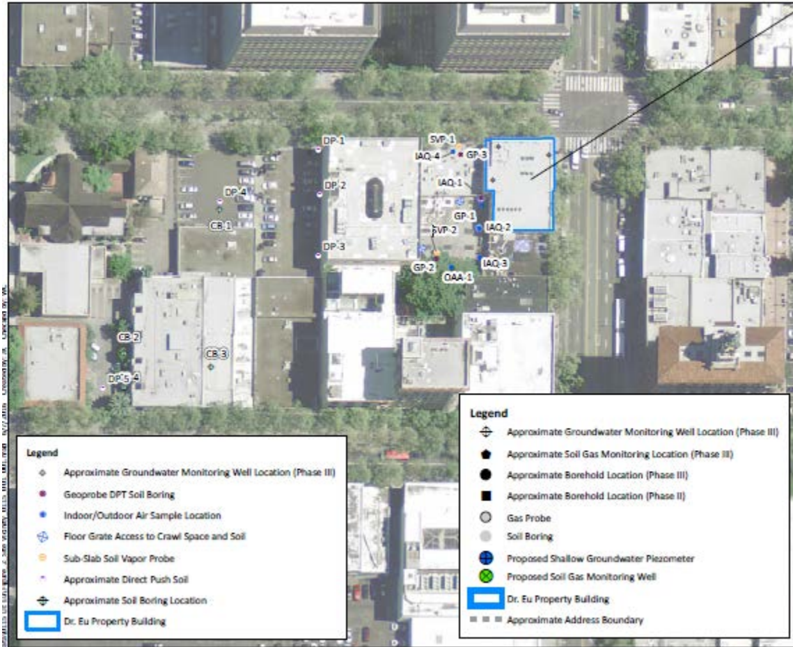
Figure 2 – Dr. Eu Buildings at western corner of East Santa Clara Street and S. Second Street, San Jose