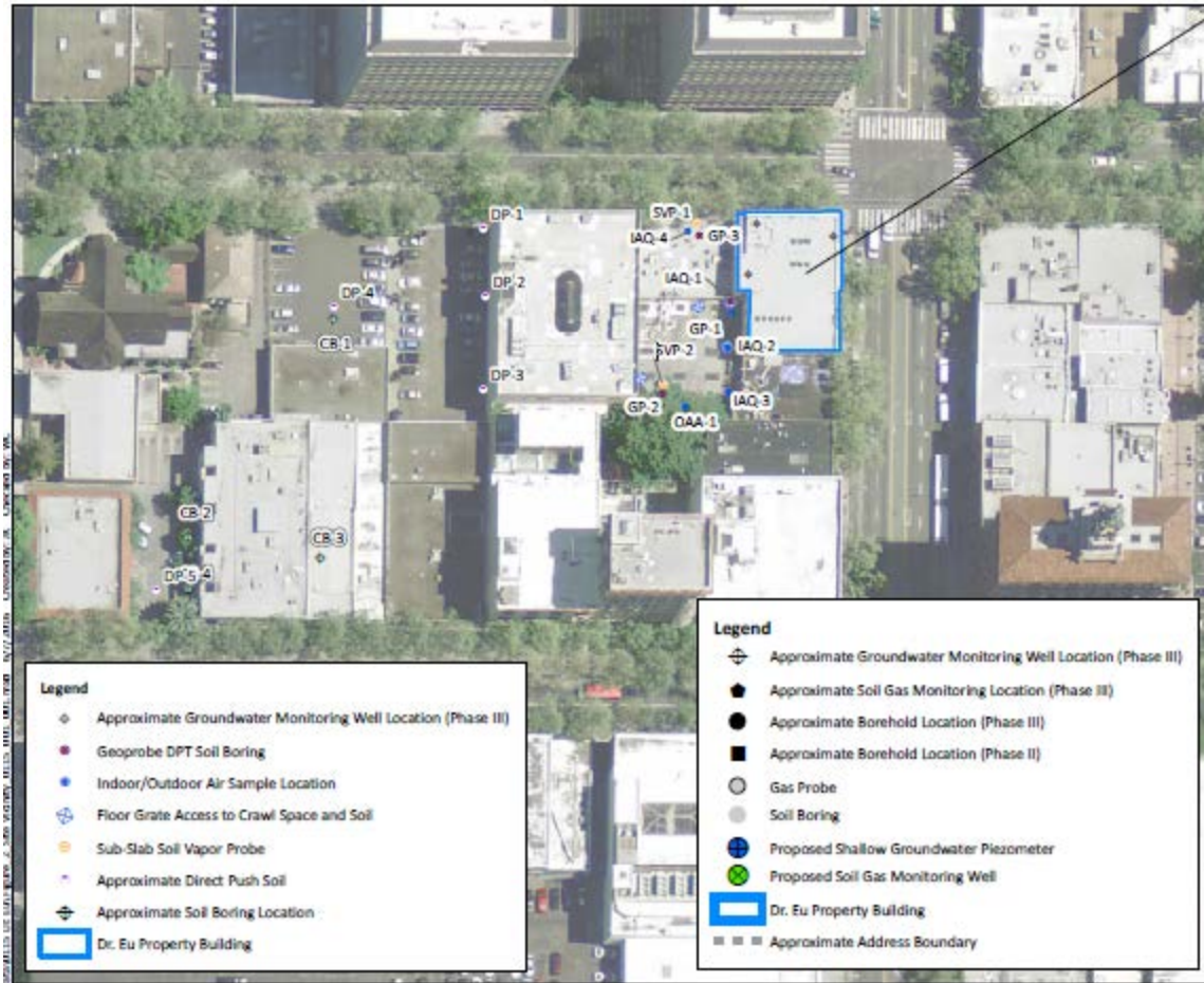
Figure 2 – Dr. Eu Buildings at western corner of East Santa Clara Street and S. Second Street, San Jose