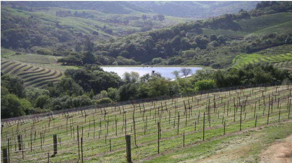
Figure 2: Mt. Veeder Vineyard

As of July 23, 943 properties have enrolled in the General Permit, corresponding to approximately 35,800 acres of vineyards planted on parcels totaling approximately 72,600 acres. By July 31, we anticipate more than 1000 properties will be enrolled, representing approximately 90 percent of the total acreage that is required to enroll by that date.