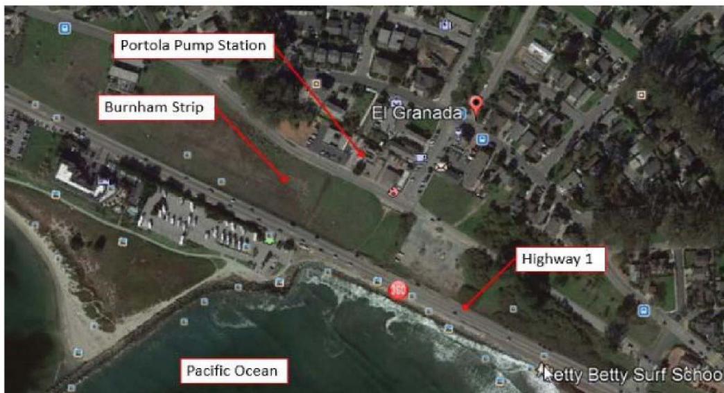
Figure 3. Vicinity map showing Burnham Strip and Portola Pump Station

Historically, Sewer Authority Mid-Coastside’s Portola Pump Station, located across the street from an open field known as Burnham Strip in El Granada (Figure 3), was subject to sewer system overflows during heavy rain. The Portola Pump Station conveys wastewater from the communities of El Granada, Moss Beach, and Montara to the Sewer Authority Mid-Coastside wastewater treatment plant located in Half Moon Bay. Infiltration and inflow into its member agencies’ separately owned collection systems can present a capacity problem during wet weather, and in 2012 Sewer Authority Mid-Coastside implemented a Wet Weather Flow Management Project at Burnham Strip.