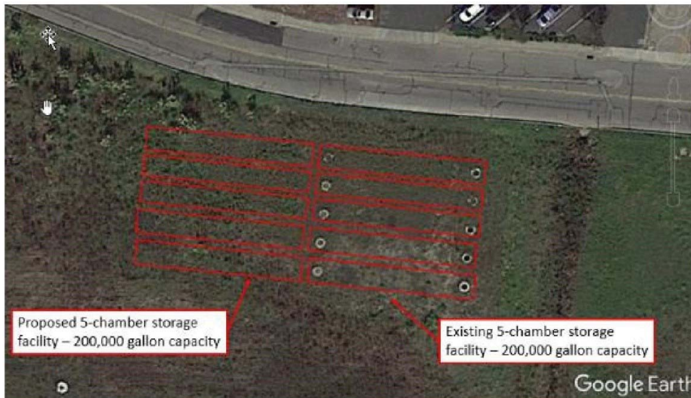
Figure 2. The project will expand existing storage capacity from 200,000 to 400,000 gallons.

Historically, Sewer Authority Mid-Coastside’s Portola Pump Station, located across the street from an open field known as Burnham Strip in El Granada (Figure 3), was subject to sewer system overflows during heavy rain. The Portola Pump Station conveys wastewater from the communities of El Granada, Moss Beach, and Montara to the Sewer Authority Mid-Coastside wastewater treatment plant located in Half Moon Bay. Infiltration and inflow into its member agencies’ separately owned collection systems can present a capacity problem during wet weather, and in 2012 Sewer Authority Mid-Coastside implemented a Wet Weather Flow Management Project at Burnham Strip.