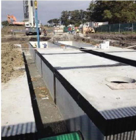
Figure 4. View of storage tanks during installation of the 2012 Wet Weather Flow Management Project

The 2012 project included five interconnected underground storage tanks to capture excess wastewater flows that exceed the Portola Pump Station's capacity. Each tank is 6 feet high, 10 feet wide, and 90 feet long (Figure 4). The existing tanks have a combined storage volume of 200,000 gallons.