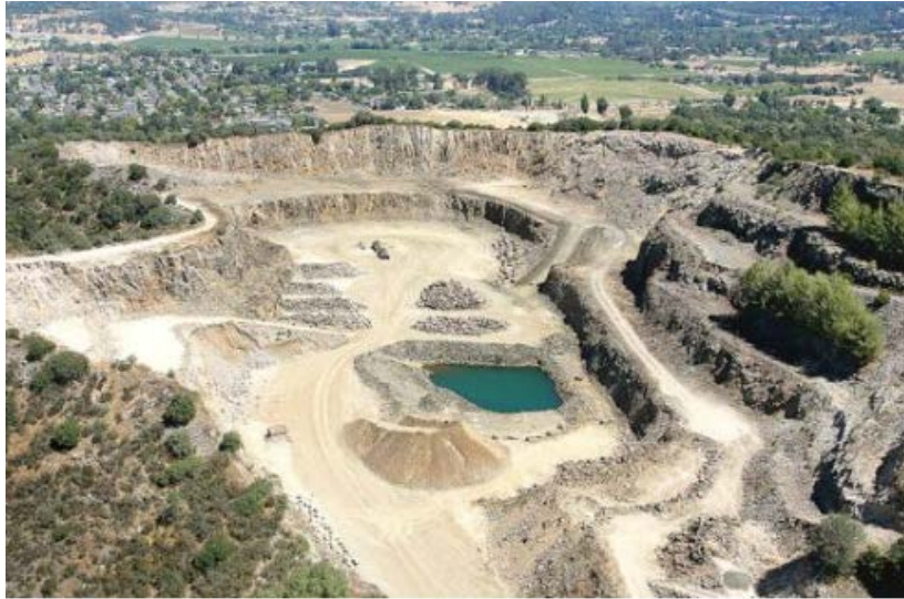
Figure 1. Syar Industries' Napa Quarry