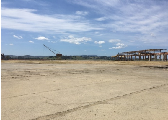
View of the site in 2019, post-excavation, looking west/northwest.

were at concentrations below their respective cleanup goals at the time the work was completed (October 2018).