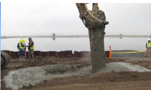
Injection of Grout Slurry

The Cut Off Wall Project included installation of a three-foot wide cutoff wall along the entire two-mile perimeter of the Pond to depths between 15 and 20 feet below grade