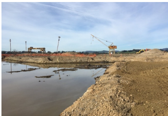
View of the site excavation in 2018, looking west.

Implementation began at the site in July 2017 and was completed in February 2018. During that time, a total of 156,645 cubic yards of soil were excavated, segregated, and stockpiled for landfarming and/or characterization.