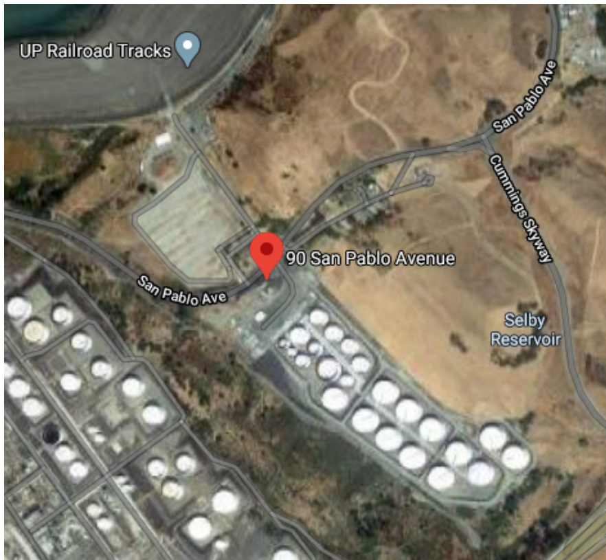
Figure 2: Location of aboveground storage tanks involved in fire at Shore Terminals Facility