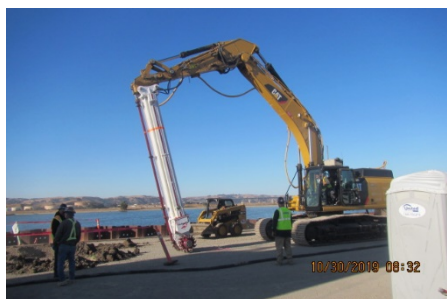
Horizontal Axis Rotary Tool