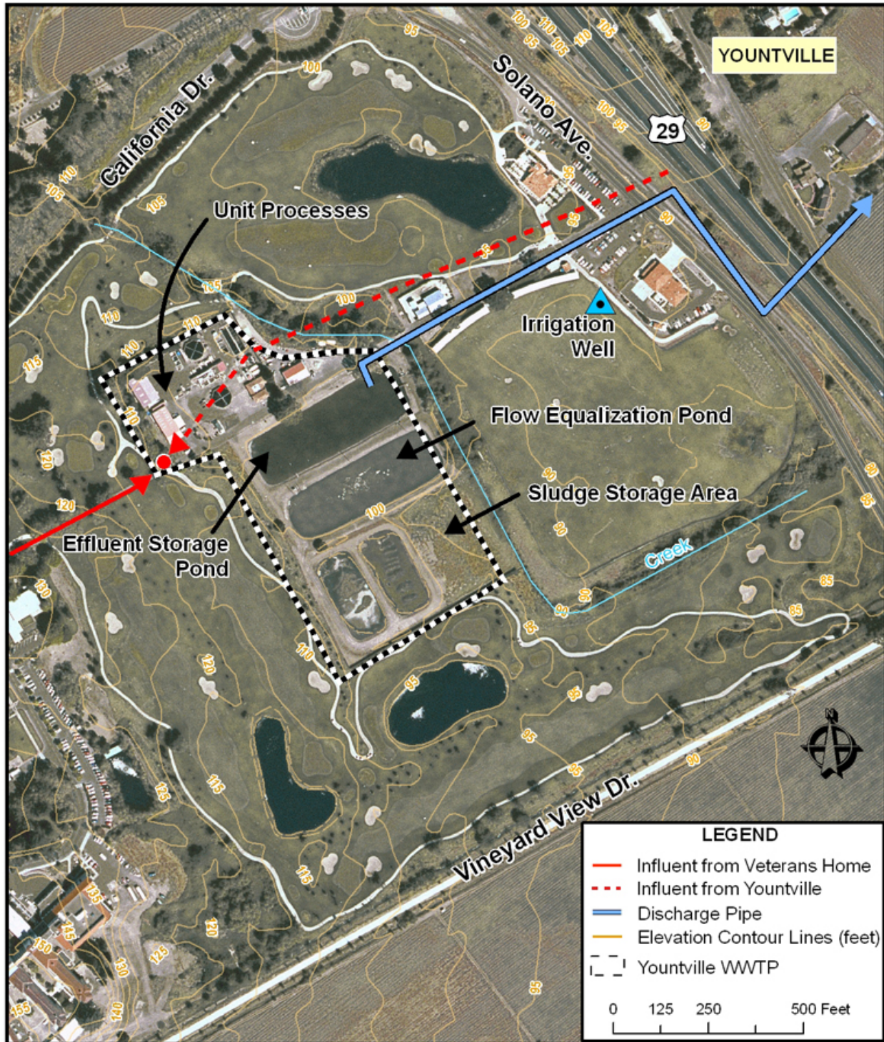
Figure B-1. Satellite Image of Facility