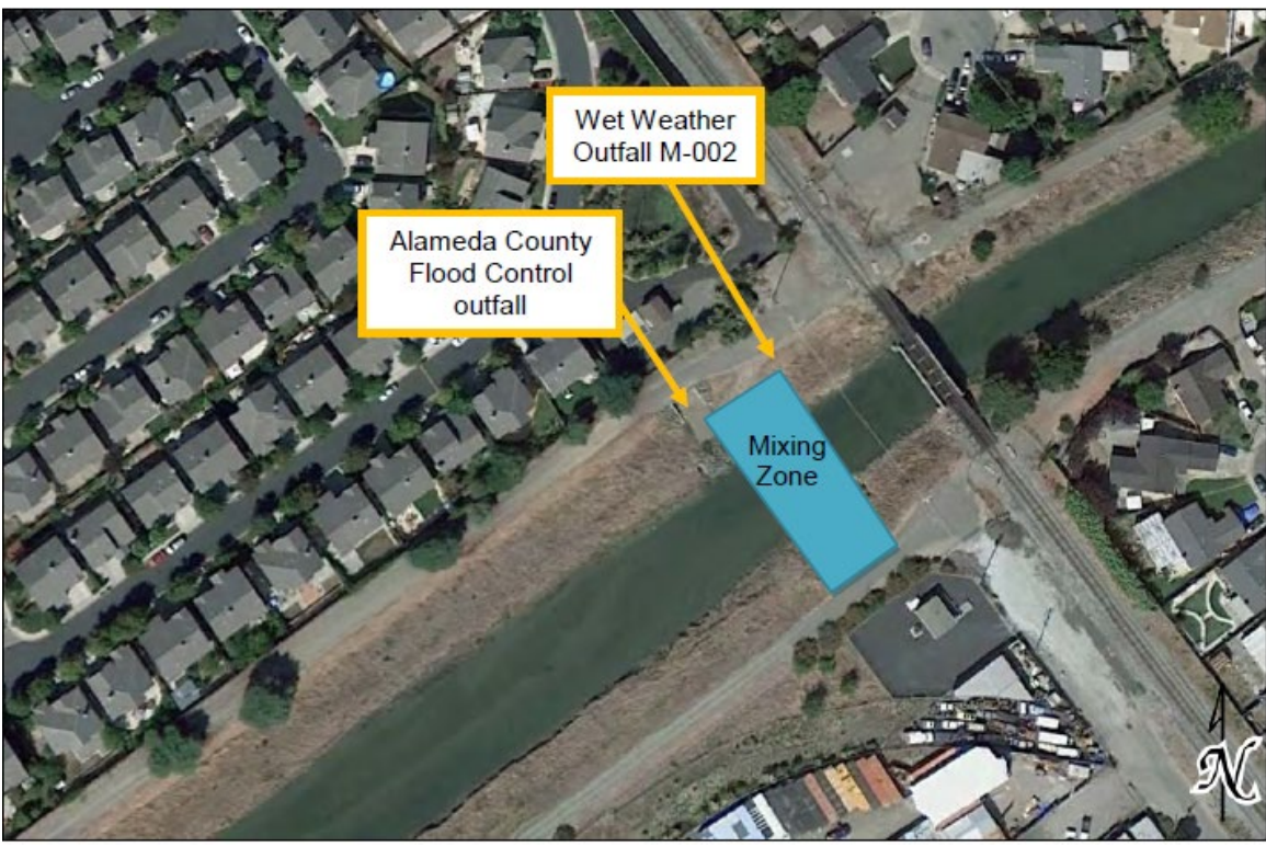
Figure 1. Aerial View of Proposed San Lorenzo Creek Mixing Zone