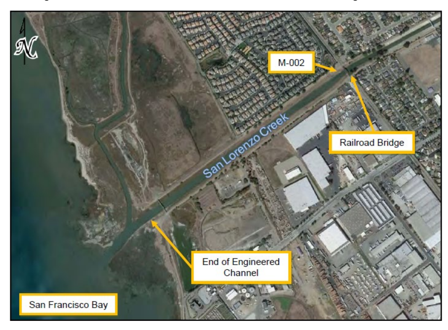
Figure B-2. Aerial View of San Lorenzo Creek Outfall and Surroundings