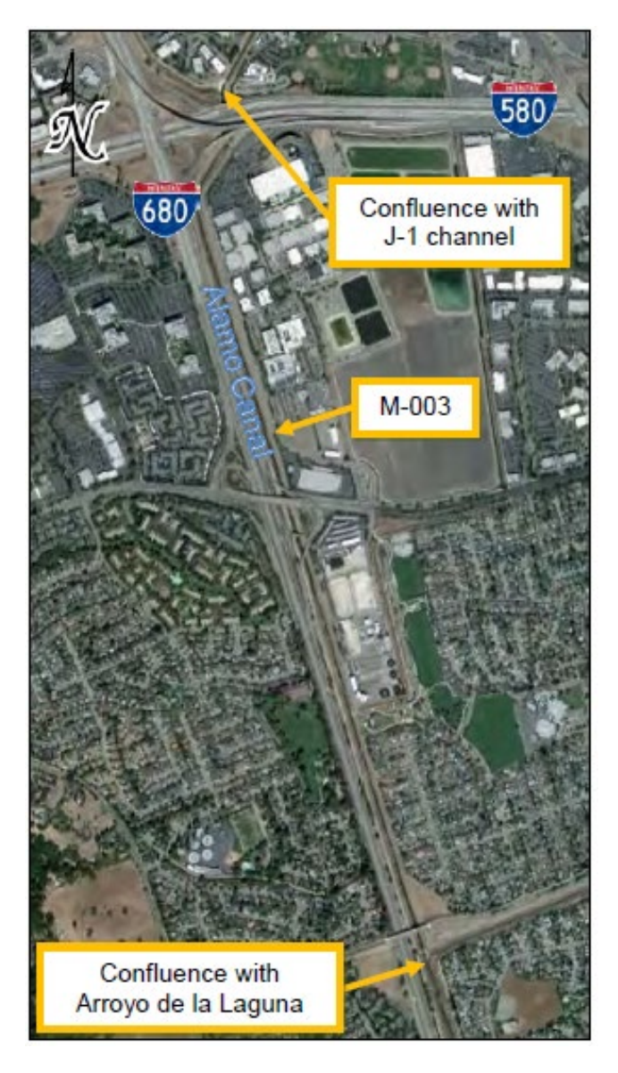
Figure B-3. Aerial View of Alamo Canal Outfall and Surroundings