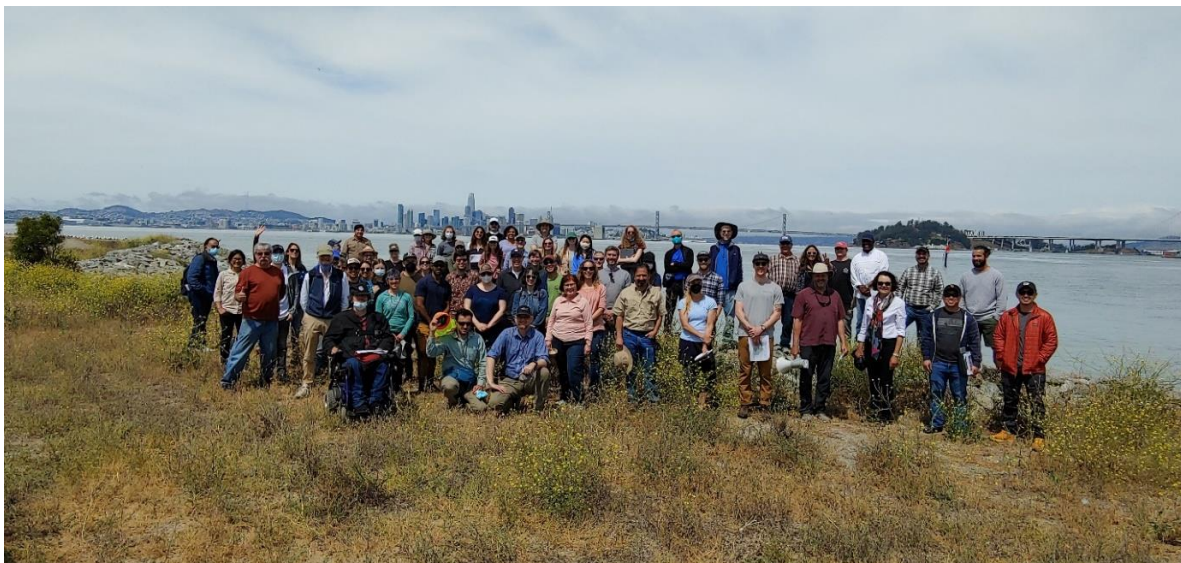
Staff of the San Francisco Regional Water Quality Control Board at the tip of Alameda Point, May 2022.