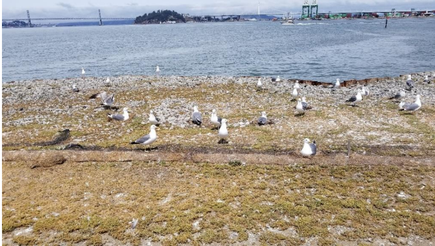
At the tip of Alameda Point, nesting seagulls and metal sheeting at edge of landfill.

Many breeding birds are a testament to effectiveness of site cleanup and wetlands restoration. On our drive out to the tip a Caspian tern flew overhead with a fish in its bill, and throughout the field trip many Caspian terns flew overhead on their way to and from fishing in the Bay. Also on our drive out to the tip, we passed by a colony of about 2,000 nesting seagulls.