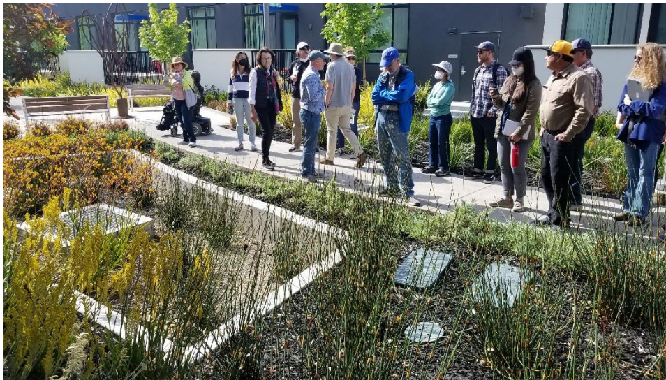
Brian Wines talking to staff and Board Member Hacker about the vegetated stormwater treatment and infiltration ponds. Here the landscape architect has installed a variety of amenities (e.g., benches at left), shapes (the path meanders past different shapes and sizes rather than narrow rectangles), and great variety of handsome vegetation. These pleasing aesthetics yield more careful maintenance.

We observed several project areas starting with the Seaplane Lagoon where cleanup was accomplished by dredging sediments contaminated with PCB and radiation. We next walked around the redeveloped ferry parking lot and residential areas to observe stormwater management. The stormwater best management practices were not only review of architectural designs and seeing their mature installation, but discussion of the human factor. In this case, pleasing aesthetics leverages the human factor of appreciation and careful maintenance.