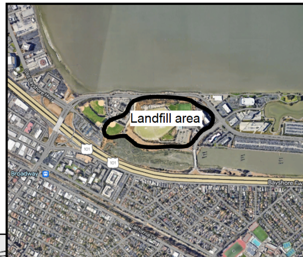
FIGURE 1. Site Plan Illustrating Monitoring Locations. (Figure based on Mactec Fourth Quarter 2004 Monitoring Report "Site Plan")