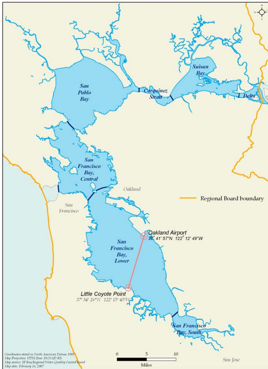
Figure 7.1 Segments of San Francisco Bay showing location of Hayward Shoals as a line connecting Little Coyote Point and the Oakland Airport.