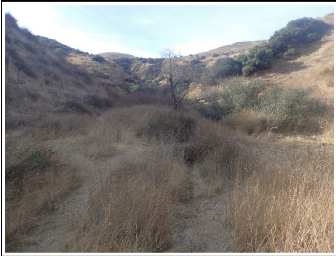
Figure 4: Photograph of Drainage Looking Upstream (southwest)