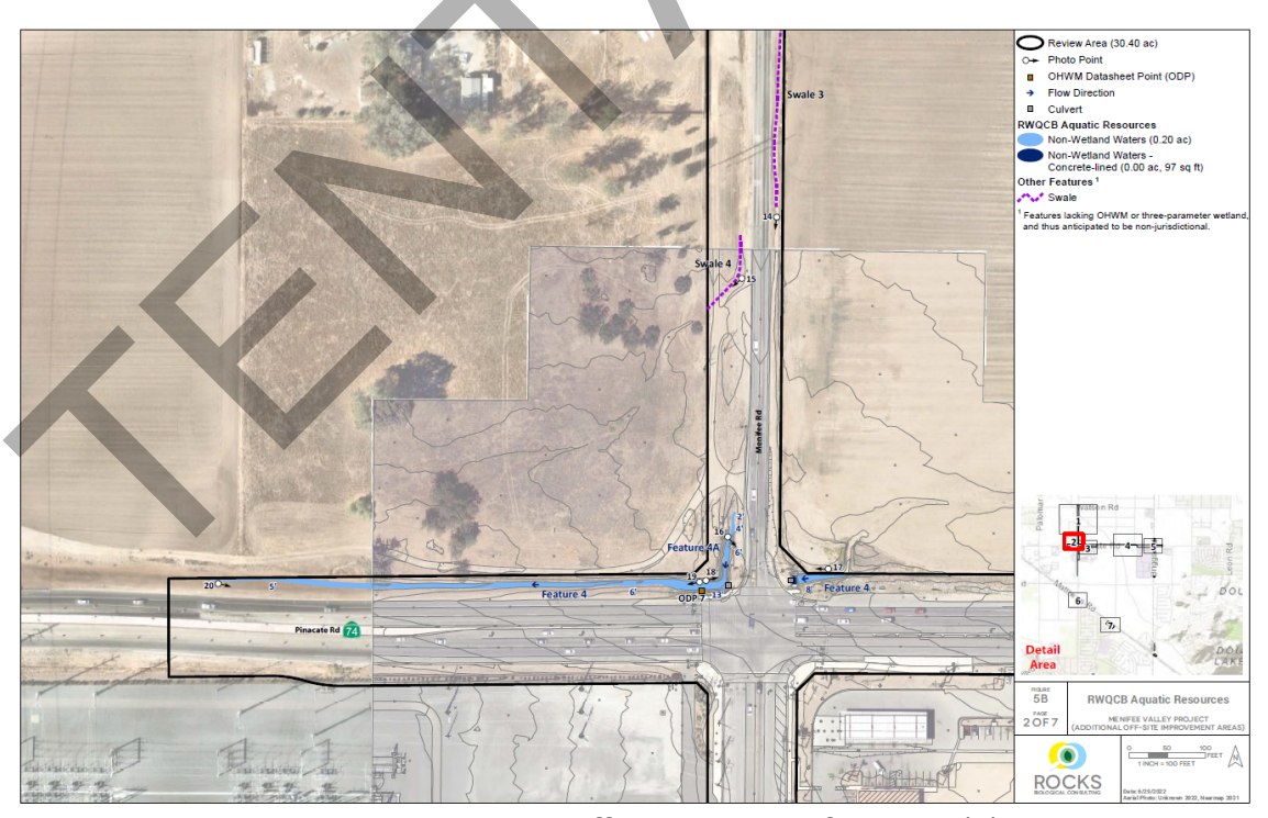
Figure 5. Impact to offsite drainage features (2)