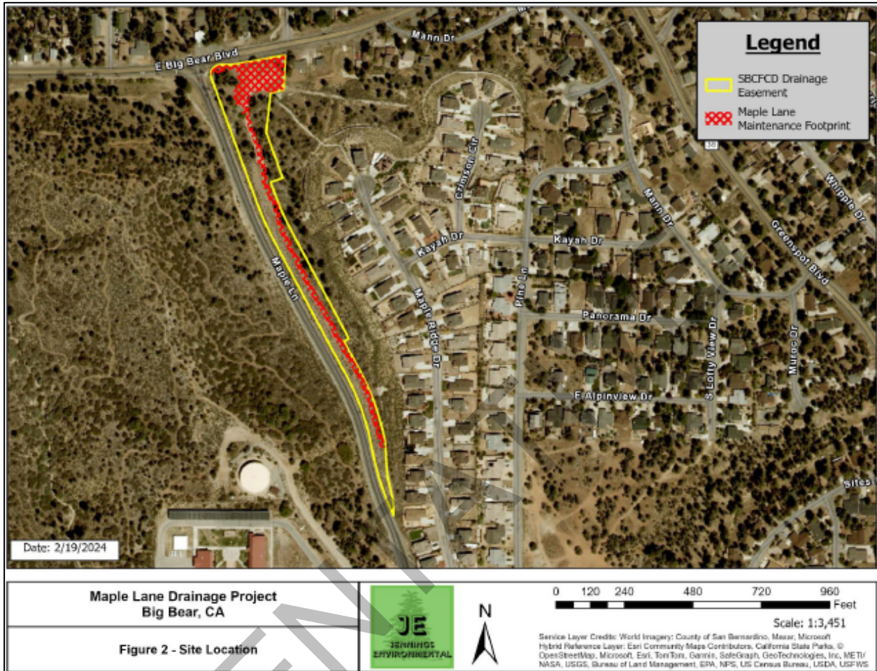
Figure 2. Site Location