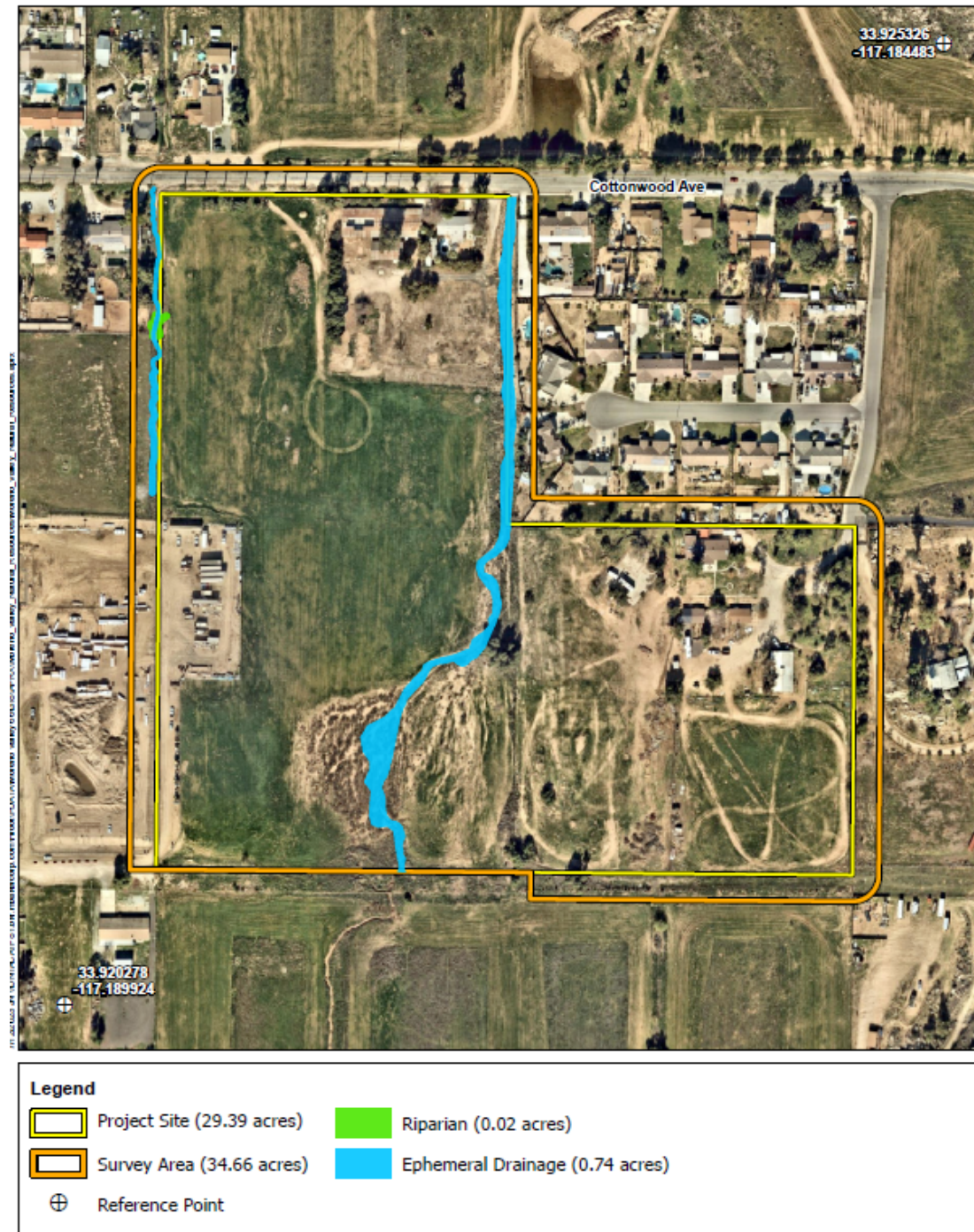
Figure 3: Project Jurisdictional Waters of the State