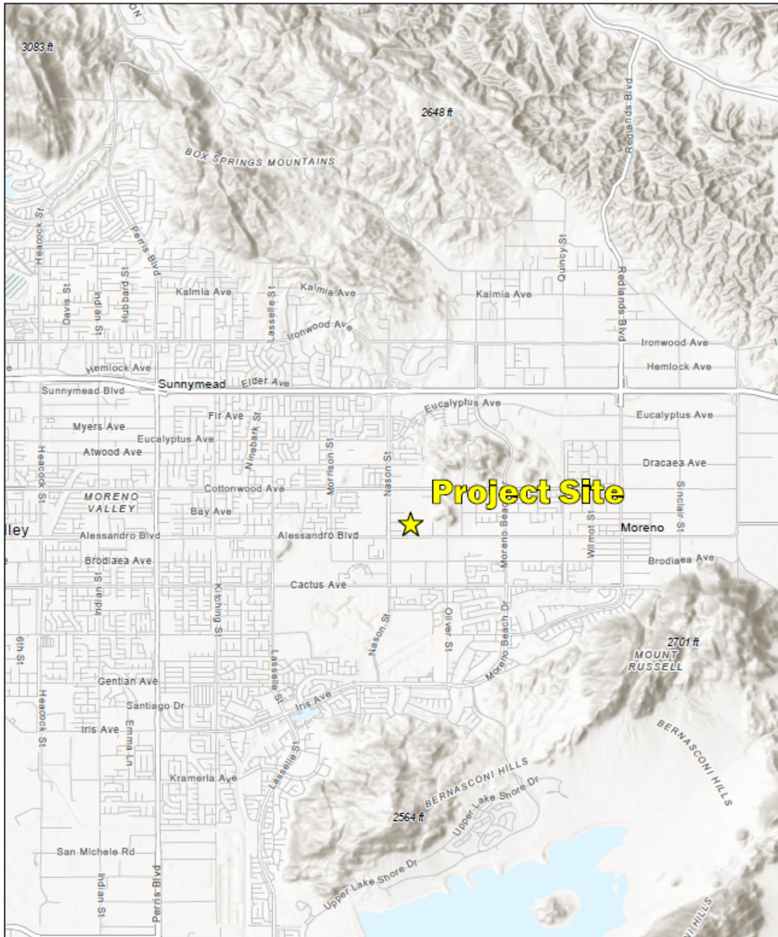
Figure 2: Project Site Location