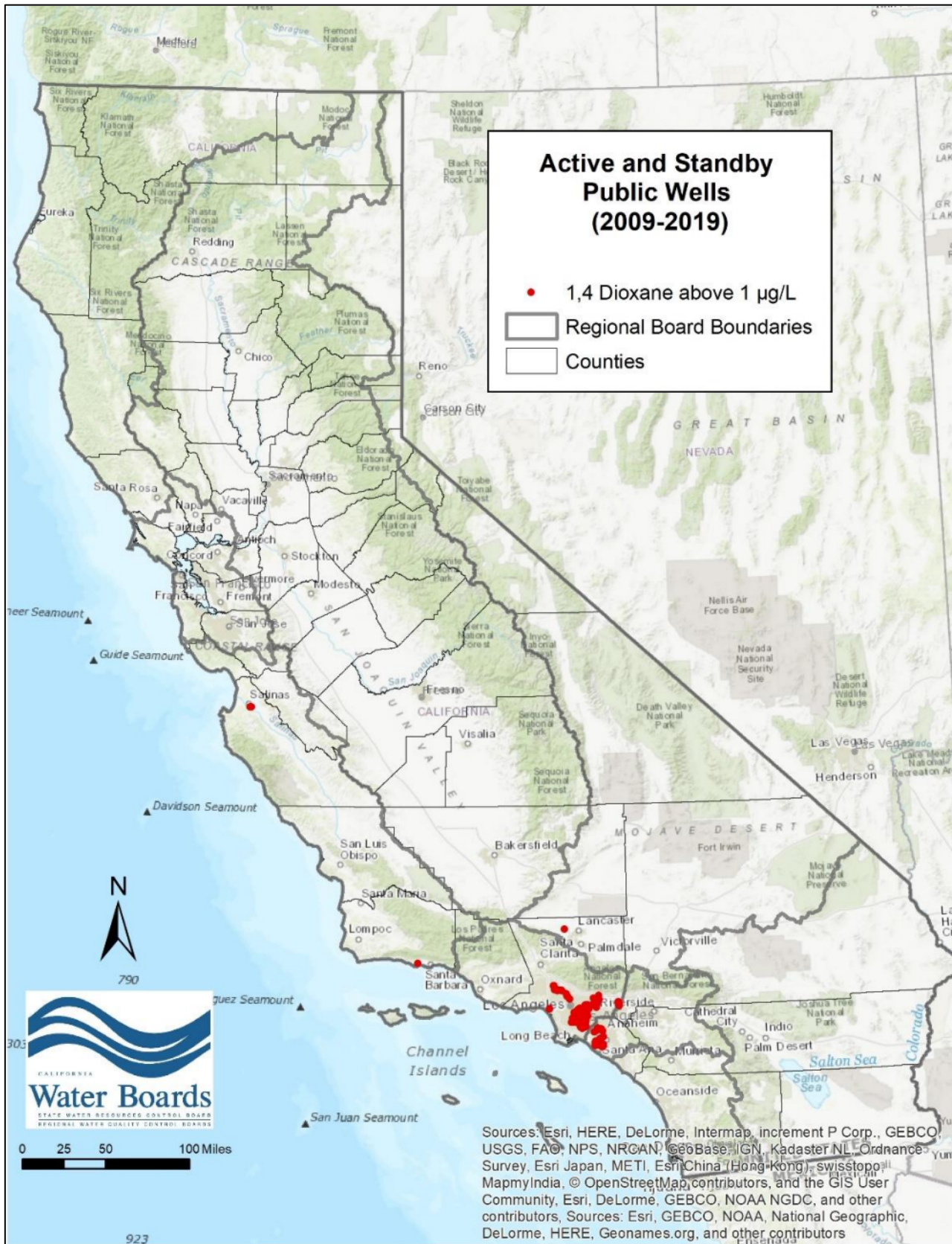
Figure 1. Active and standby public drinking water wells that had at least one detection of 1,4 Dioxane above the NL, 2009-2019, 194 wells.