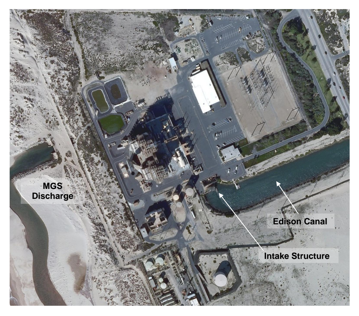
Figure 2. Mandalay Generating Station plant site and intake area.