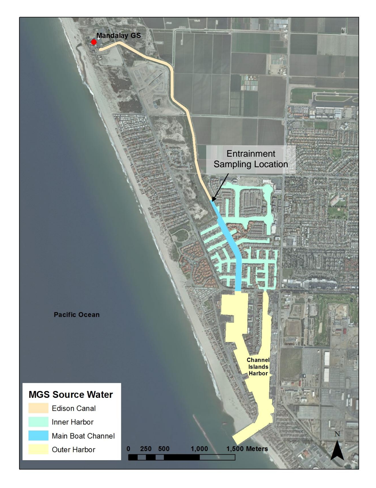
Figure 1. Mandalay Generating Station source water area based on NOAA, USACE, and GIS data and proposed entrainment sampling location.